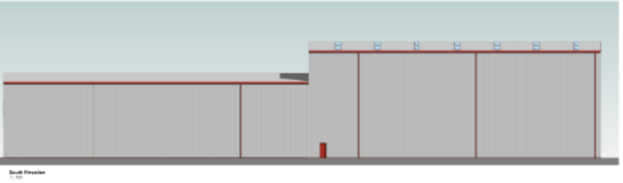
South Elevation 1:100

MARTIN WAL ARCHITECTS 123/124 Commercial Rd Adelaide SA 5000 Phone: +61 8 836 4122 Email: info@martinwal.com.au Website: www.martinwal.com.au