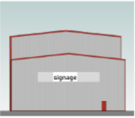
West Elevation 1:100