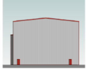
East Elevation 1:100

CONTRACT 1. ARCHITECT: MARTIN WAL ARCHITECTS 2. CLIENT: [unreadable] 3. PROJECT: [unreadable] 4. ADDRESS: [unreadable] 5. DATE: [unreadable] 6. SCALE: 1:100 7. DRAWING NO: [unreadable]