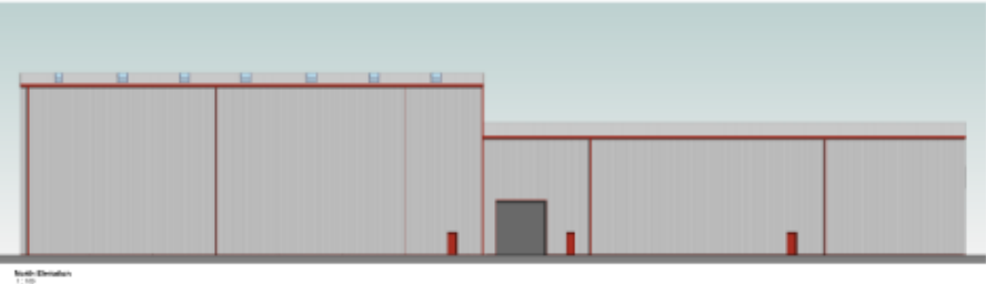
North Elevation 1:100

CONTRACT 1. ARCHITECT: MARTIN WAL ARCHITECTS 2. CLIENT: [unreadable] 3. PROJECT: [unreadable] 4. ADDRESS: [unreadable] 5. DATE: [unreadable] 6. SCALE: 1:100 7. DRAWING NO: [unreadable]