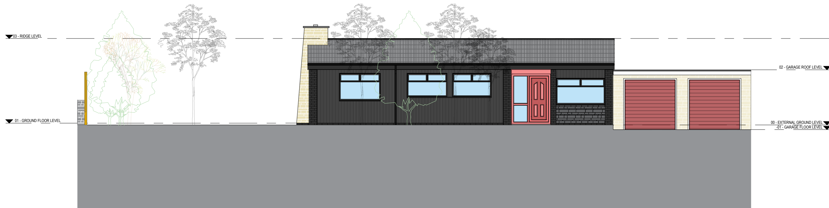
Existing Front Elevation 1 : 100