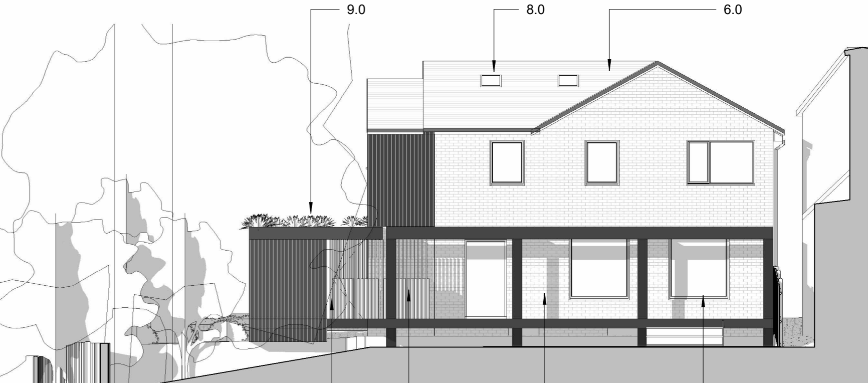
2 Rear 1 : 100