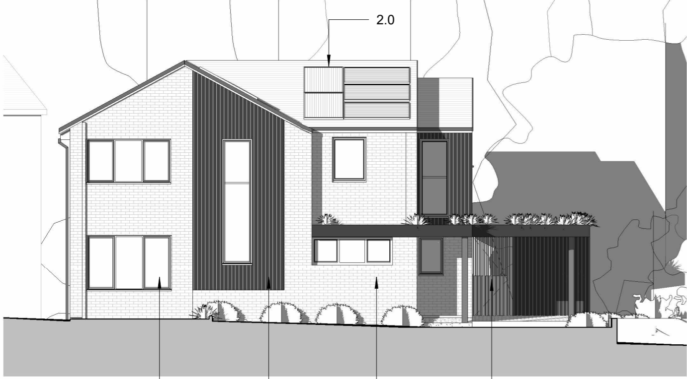
1 Front 1 : 100