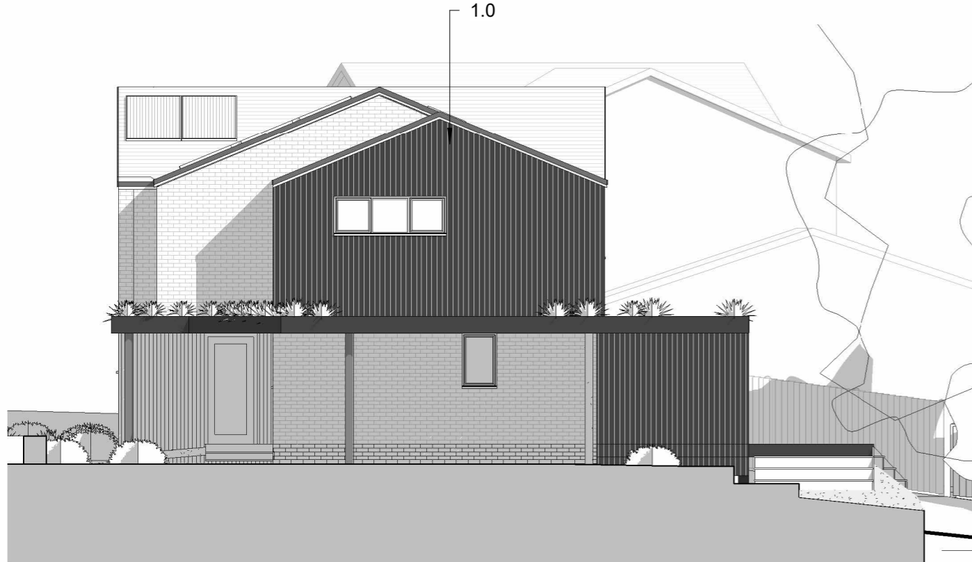
3 East Proposed 1 : 100