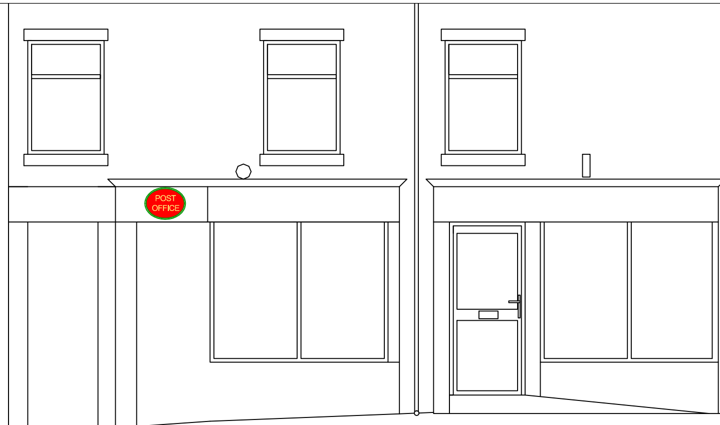
AGNES ROAD EXISTING ELEVATION @1:50