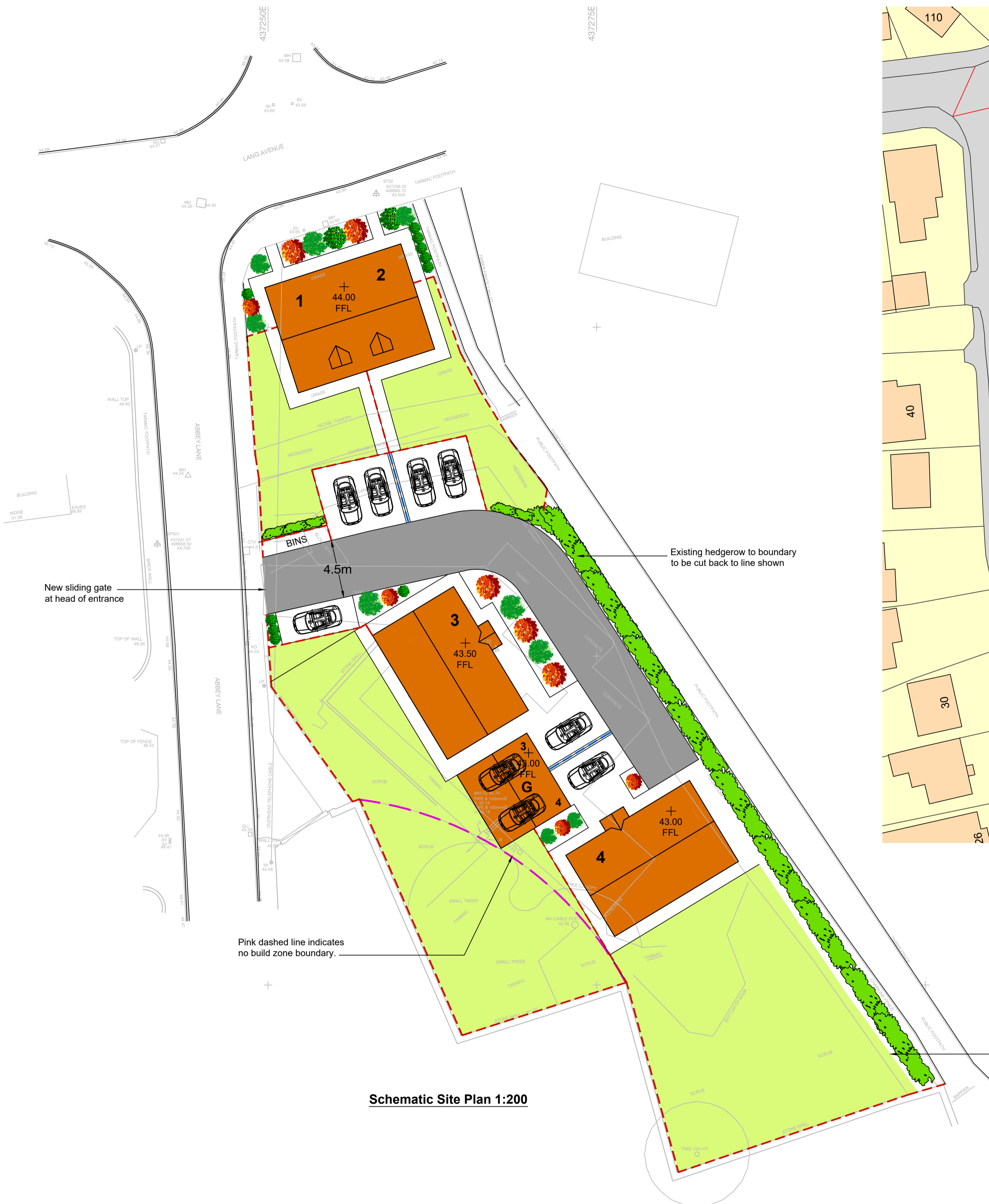
Schematic Site Plan 1:200

THIS DRAWING IS TO BE READ IN CONJUNCTION WITH DRAWINGS AND DETAILS PRODUCED BY TOPPING ENGINEERS LTD