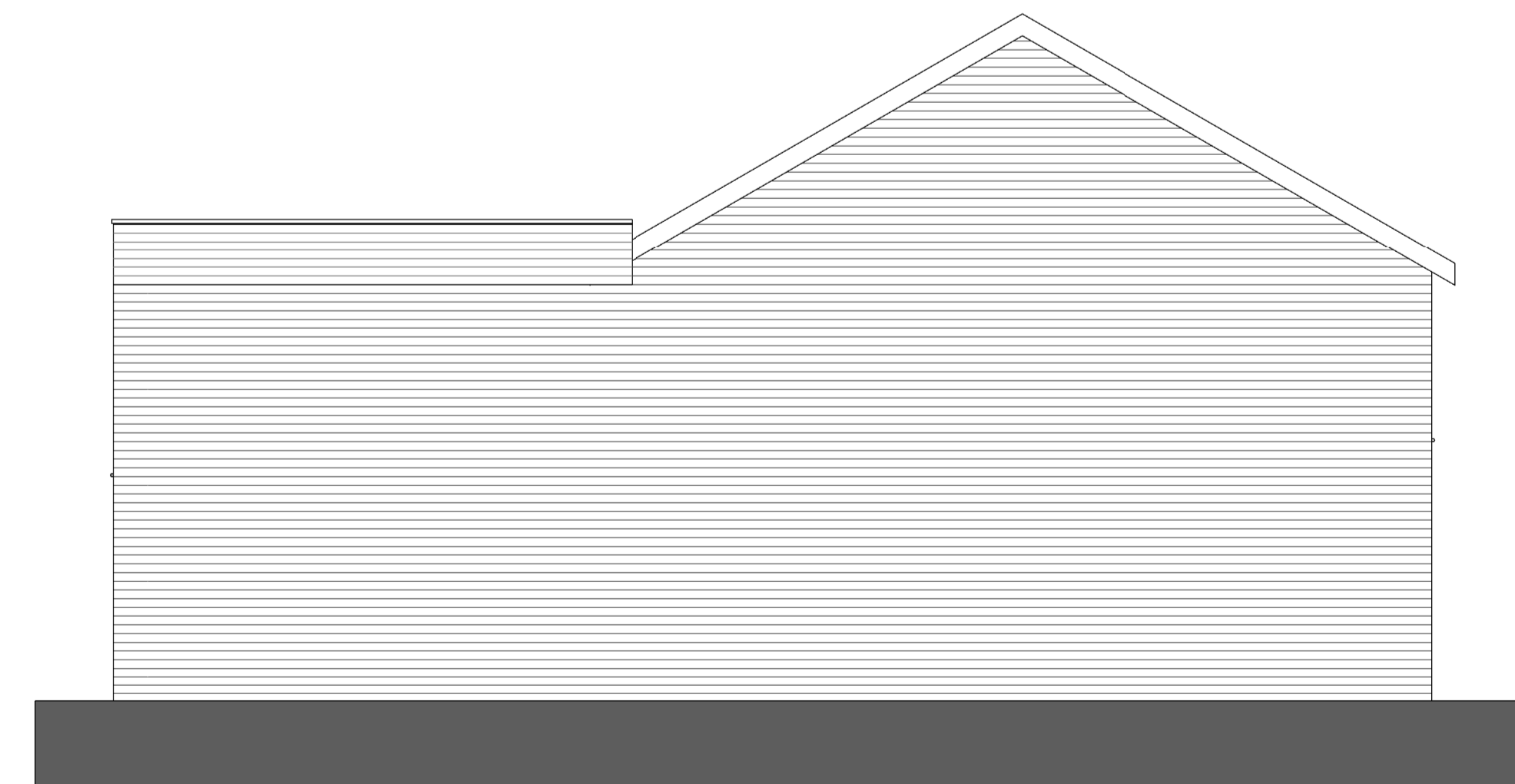
Proposed Right Side Elevation 1:50