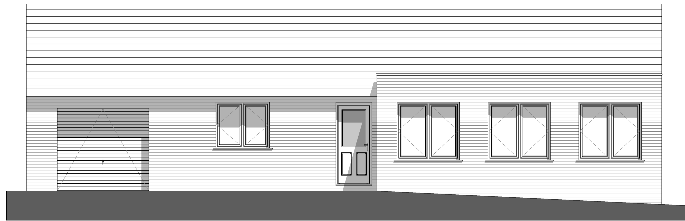
Proposed Front Elevation 1:50