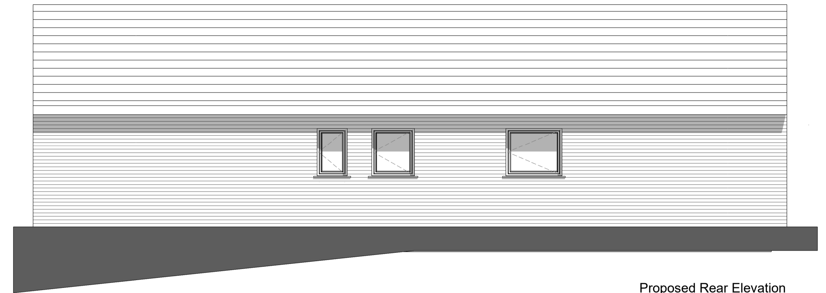
Proposed Rear Elevation 1:50