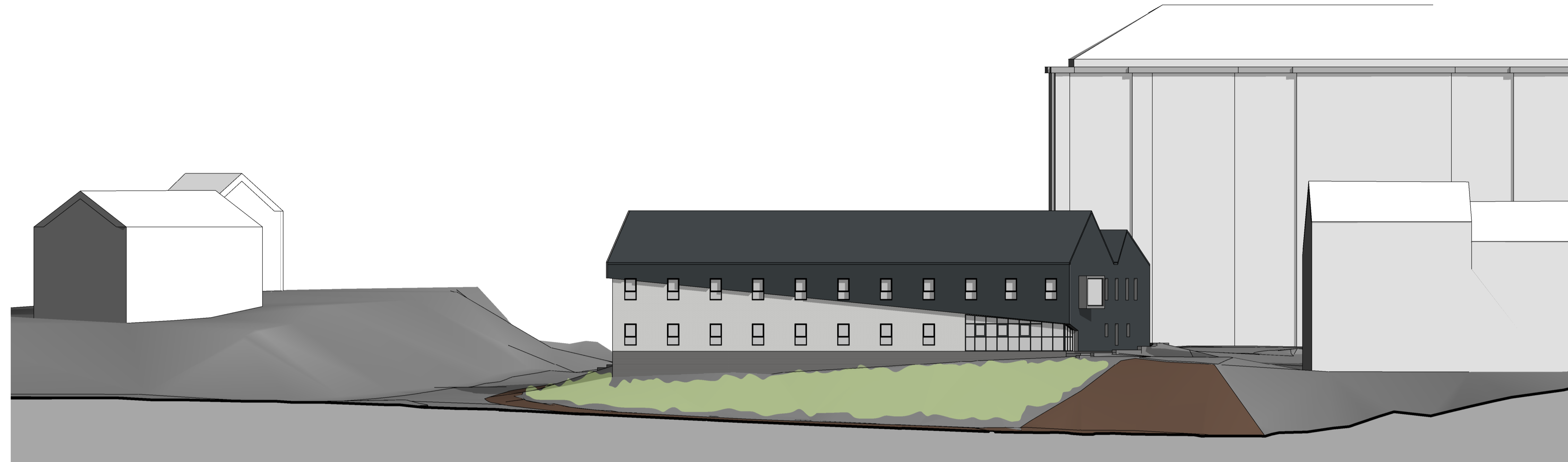
5 Elevation Indicating Context 1 1 : 200

This copy has been made by and with the authority of the person required to make the plan and drawing open to public inspection pursuant to Section 47 of the Copyright, Designs and Patents Act 1988. Unless that Act provides a relevant exception to copyright, the copy must not be copied without the prior permission of the copyright owner. If any copy is made under the authority only the whole drawing including the copyright holder's name and this notice, is to be copied."