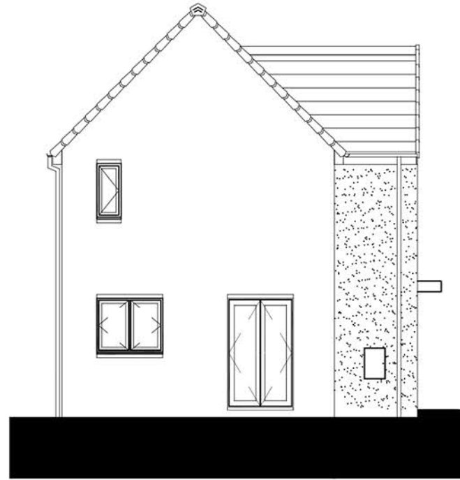
Right Elevation. 1 : 100