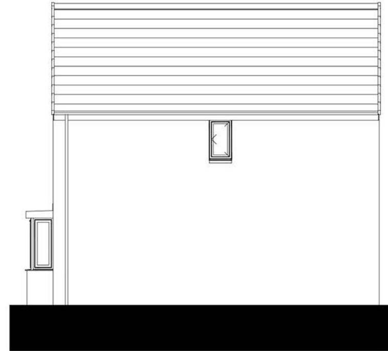
Rear Elevation. 1 : 100