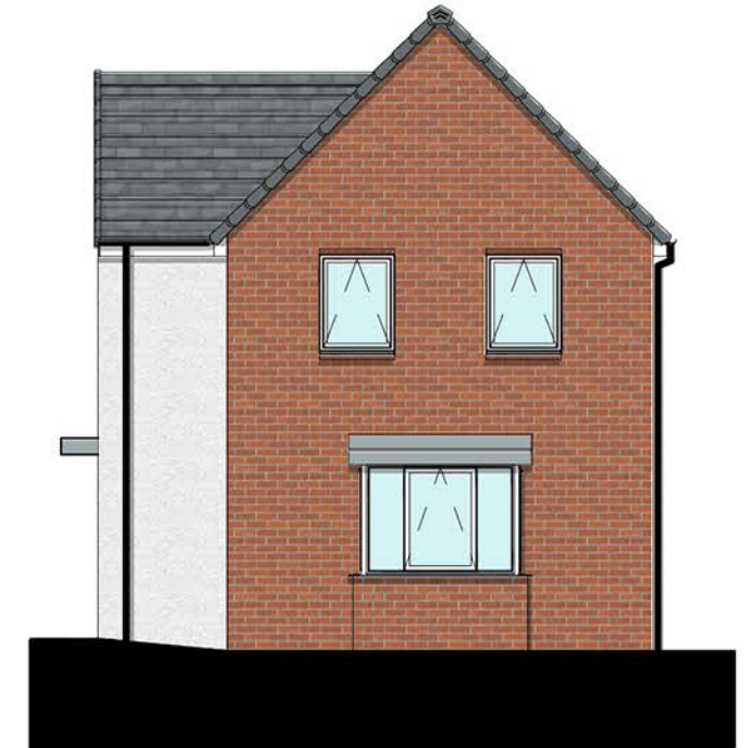
Left Elevation. 1 : 100