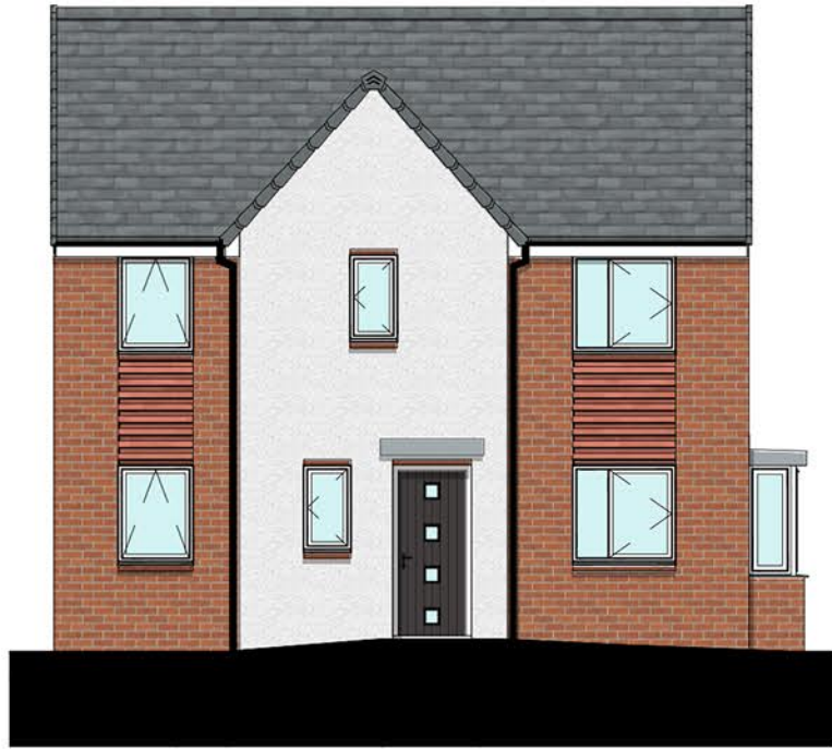
Front Elevation. 1 : 100