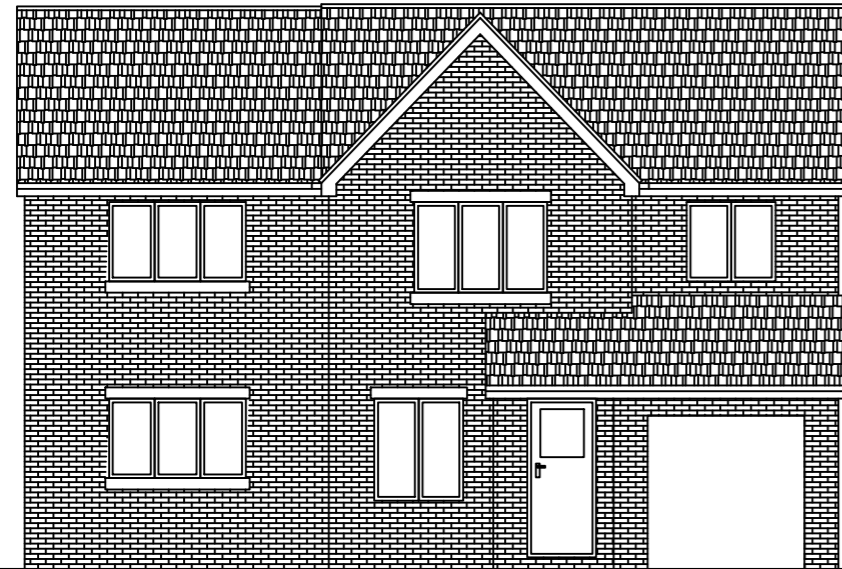
PROPOSED FRONT ELEVATION SCALE 1:100 AT A3