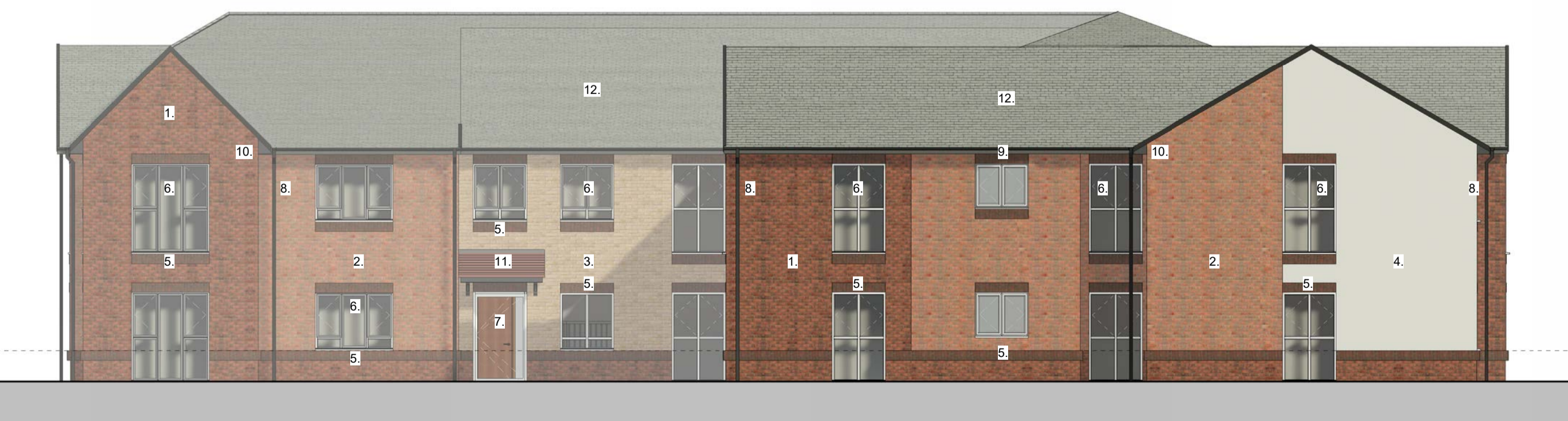
North Elevation- main entrance