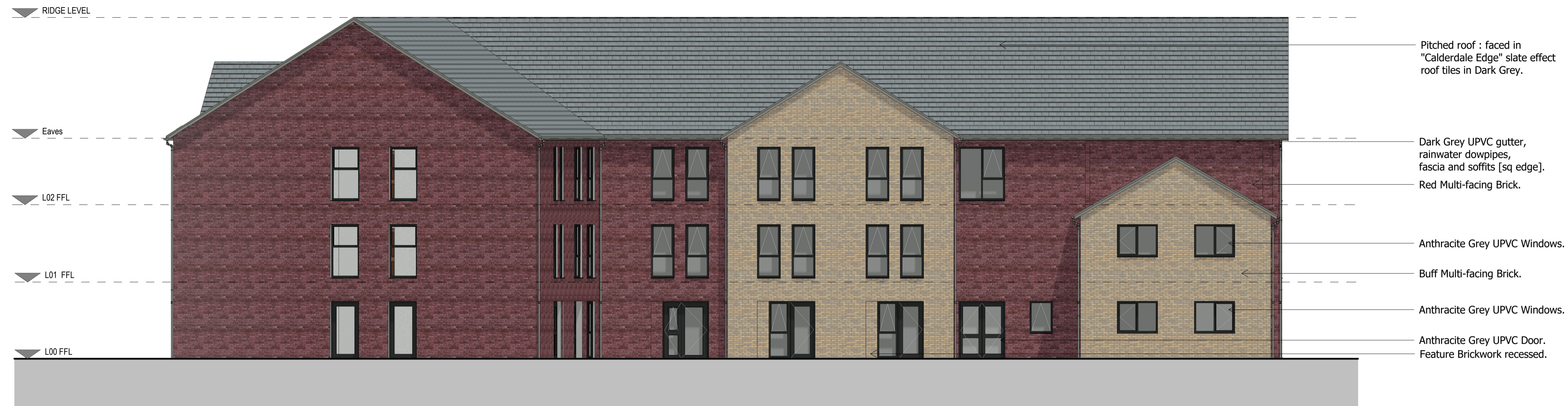
1 | Elevation A - South 1 : 100