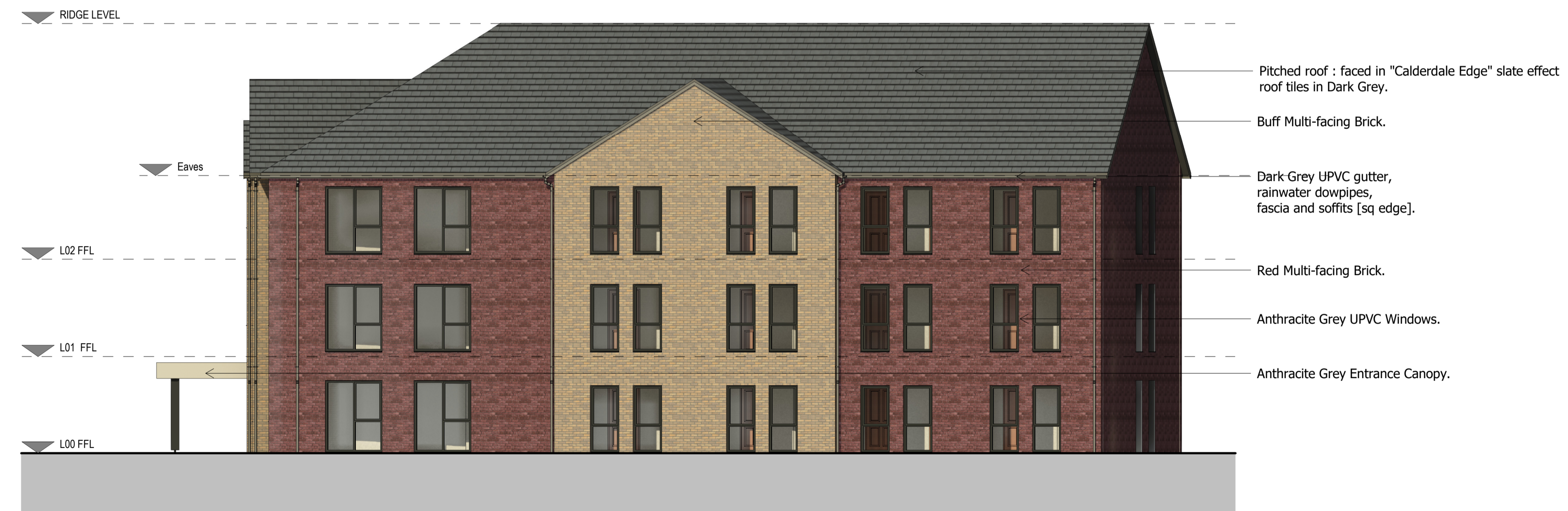
2 | Elevation B- West 1 : 100