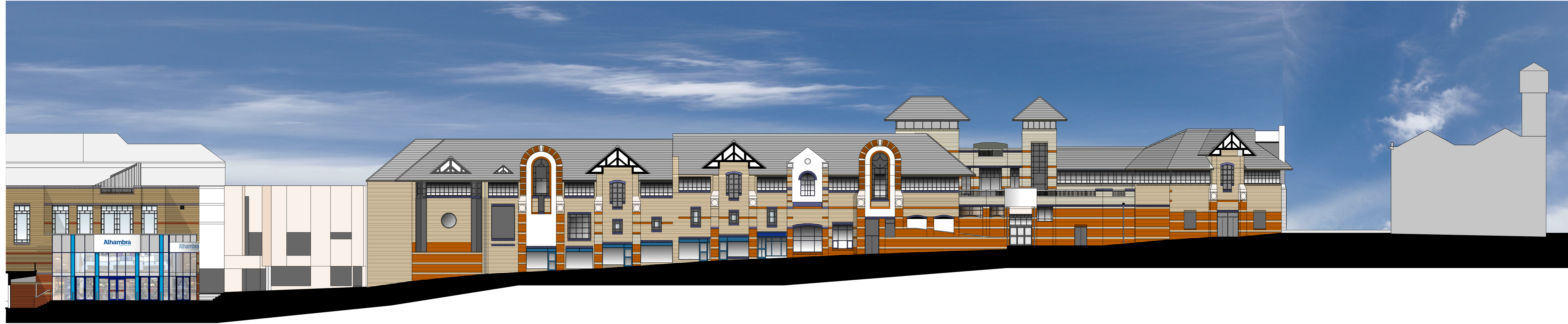
(A) NEW STREET ELEVATION