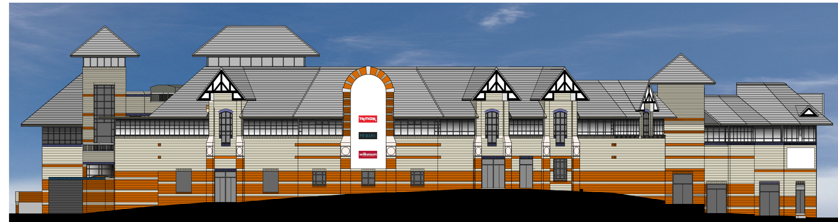
(B) NEW STREET / WEST WAY ELEVATION