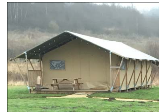
ILLUSTRATION OF LODGE