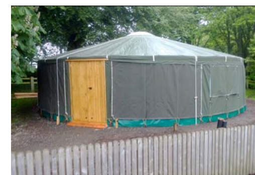
ILLUSTRATION OF YURT