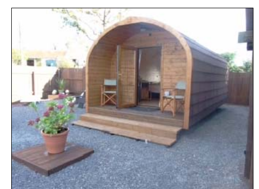
ILLUSTRATION OF PODS

This drawing is the copyright of AXIS P.E.D Limited and may not be loaned, copied or reproduced in any way - or used for any offer, quote, tender or construction purposes without written consent of the company to do so