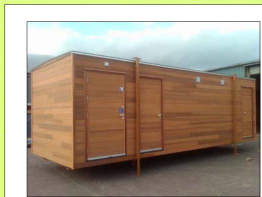
ILLUSTRATION OF POTENTIAL SHOWER/ WC BLOCKS