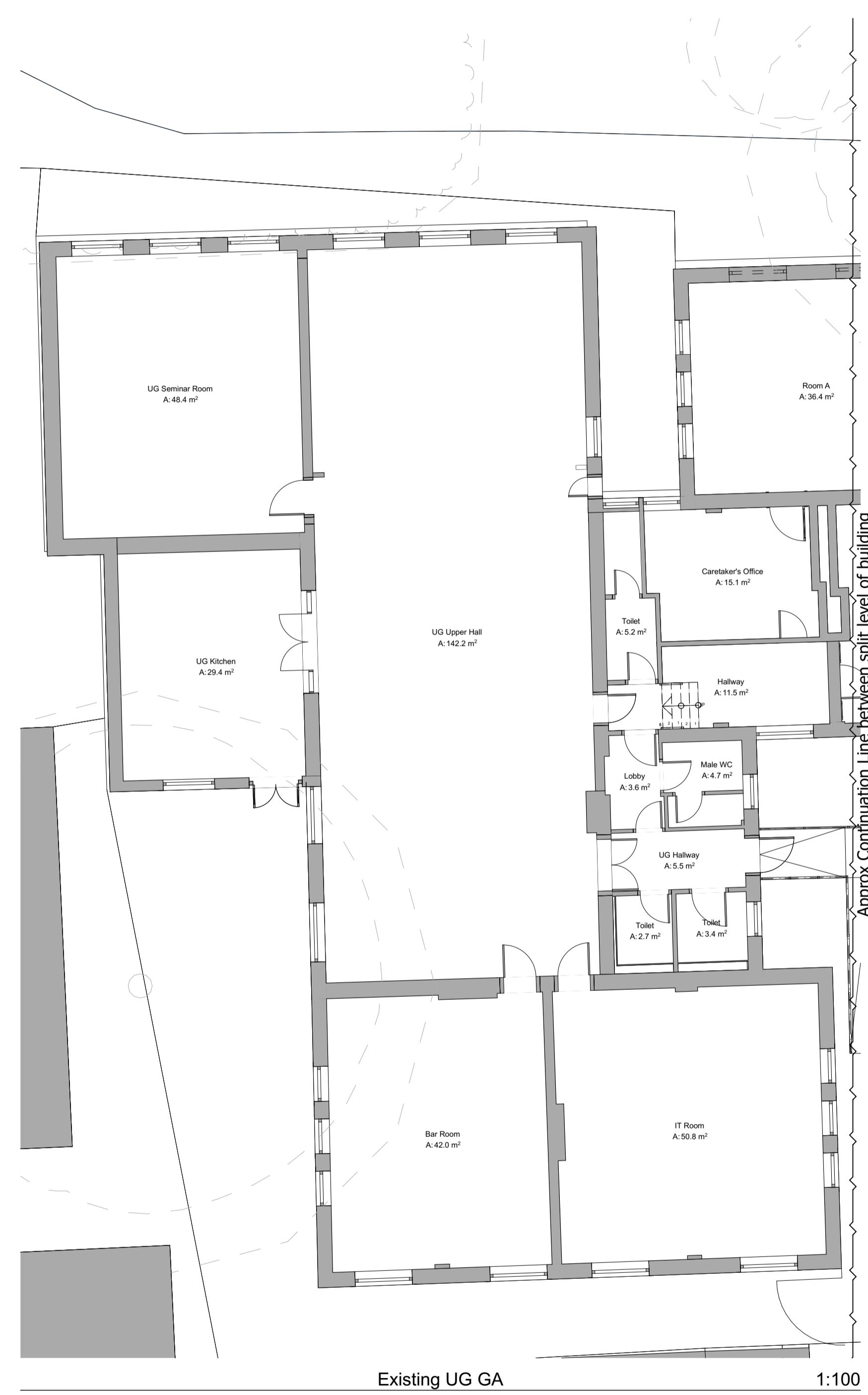
Existing UG GA 1:100