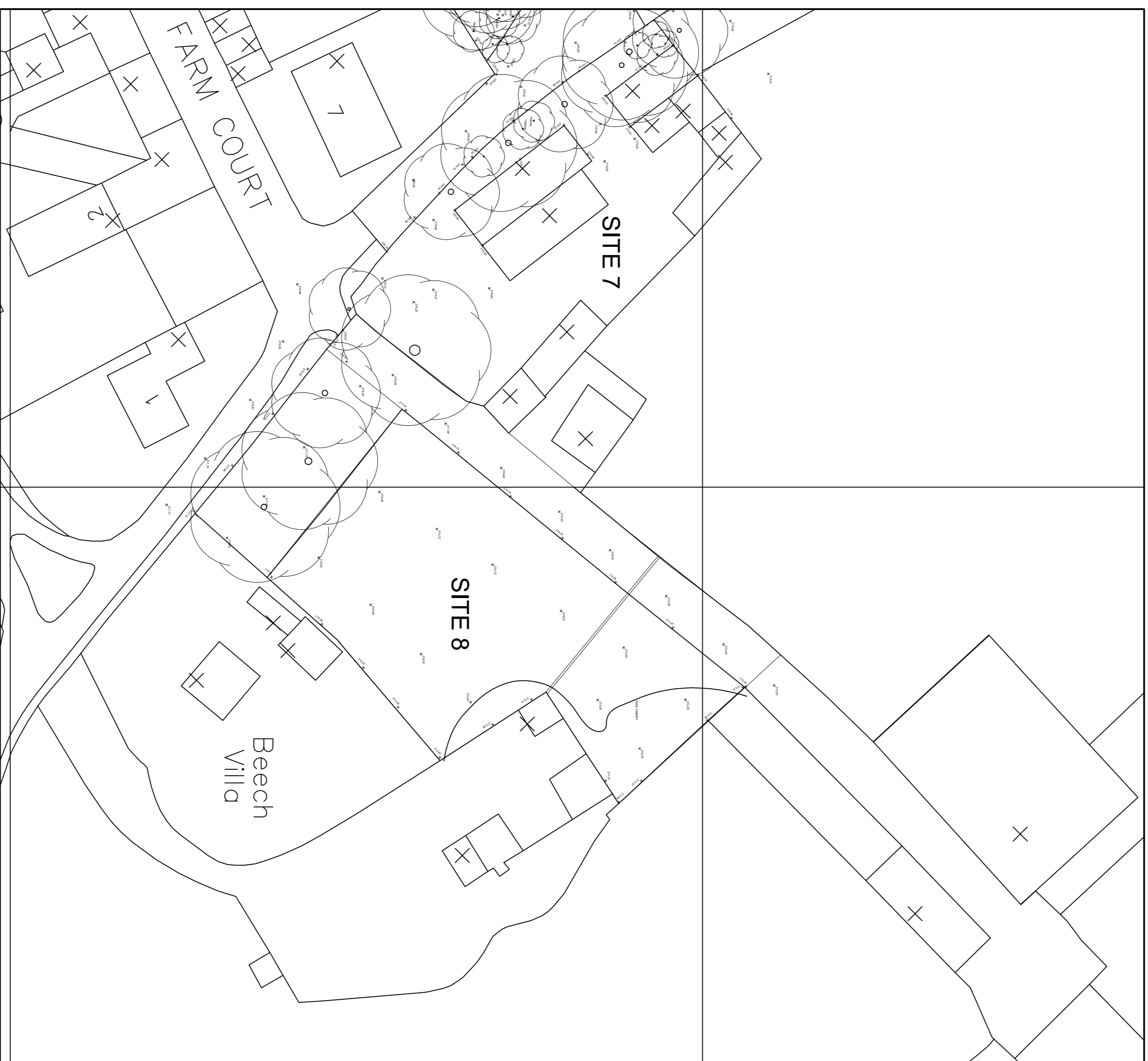
LAYOUT AS EXISTING 1:500