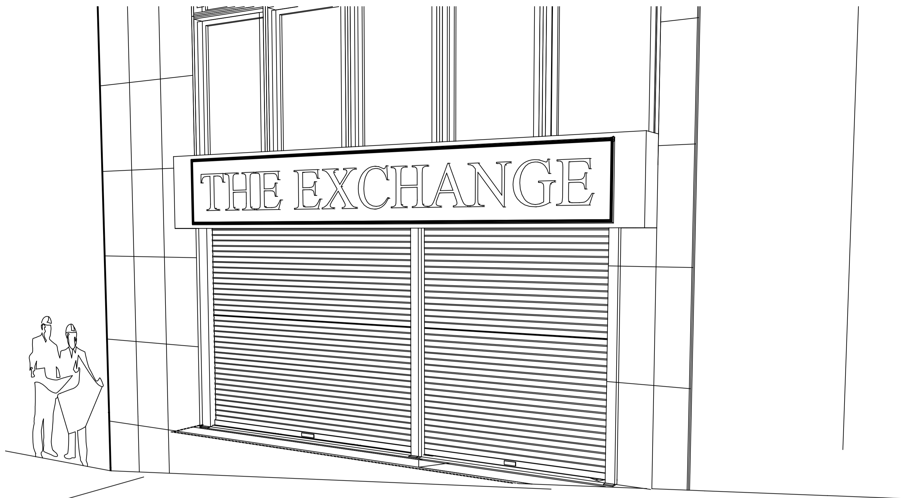
Proposed Front Elevation Detail Perspective