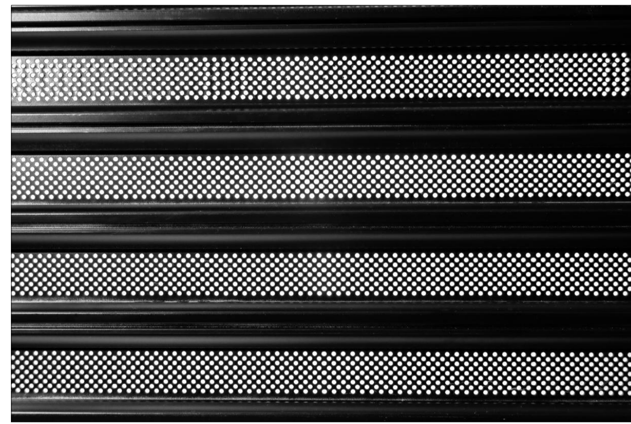
Perforated Roller Shutter Detail