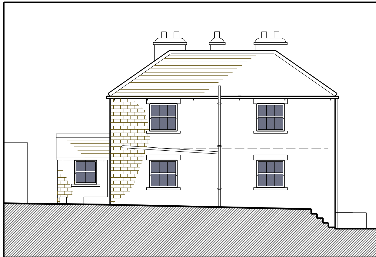
South Elevation - Existing