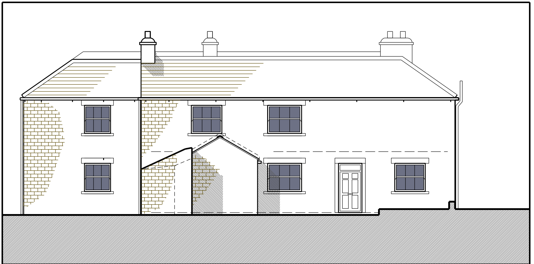
West Elevation - Existing