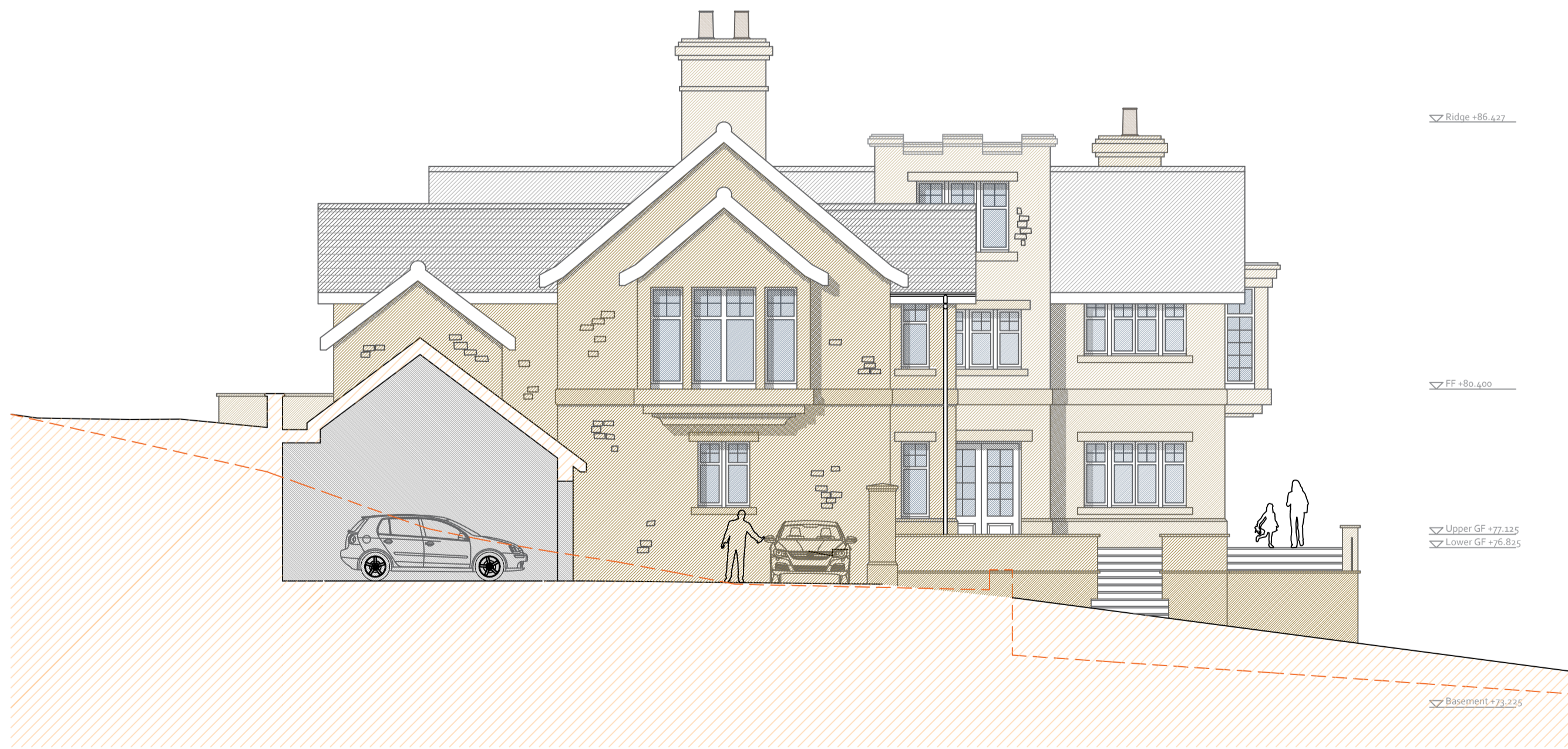
C - Side (West) Elevation