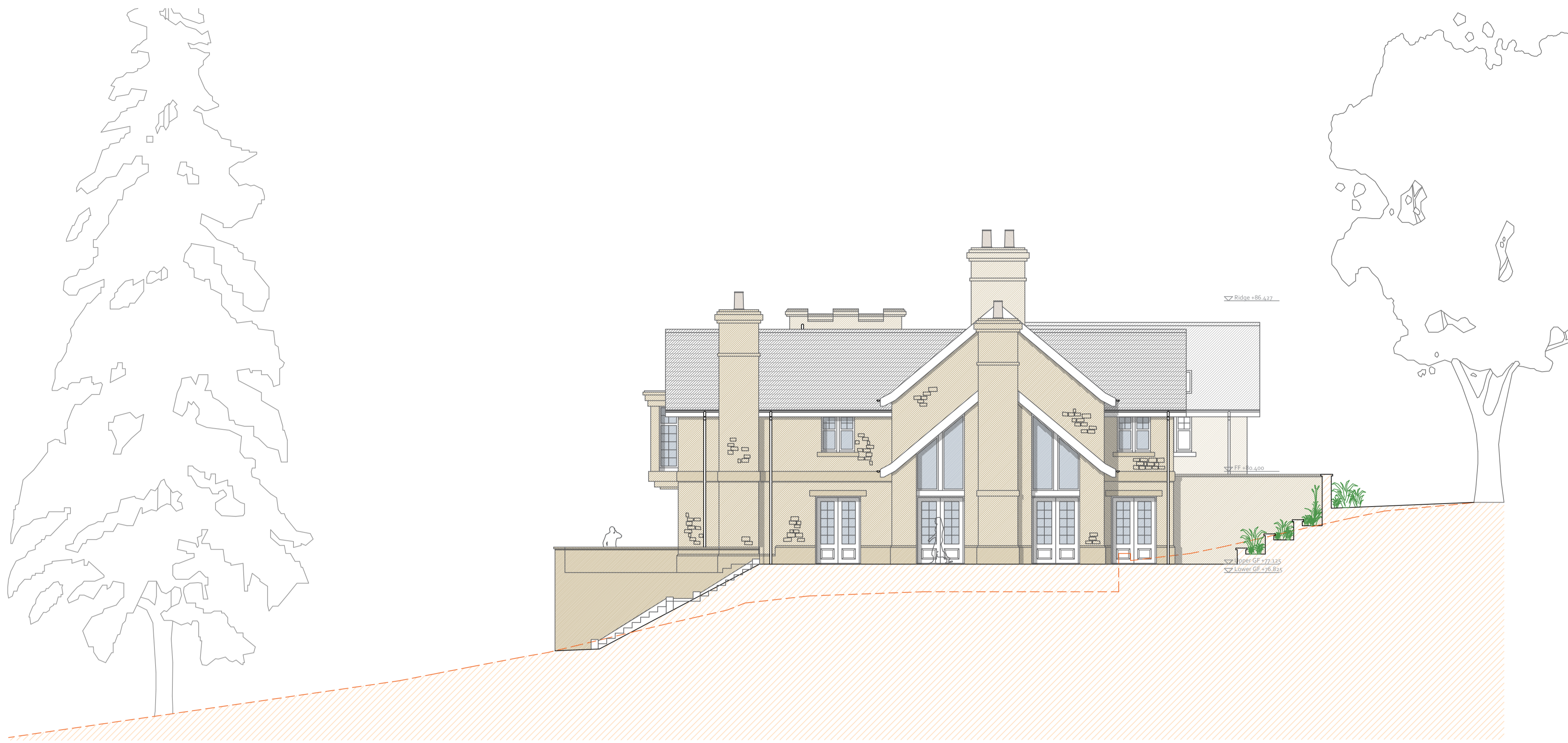
E - Side (East) Elevation