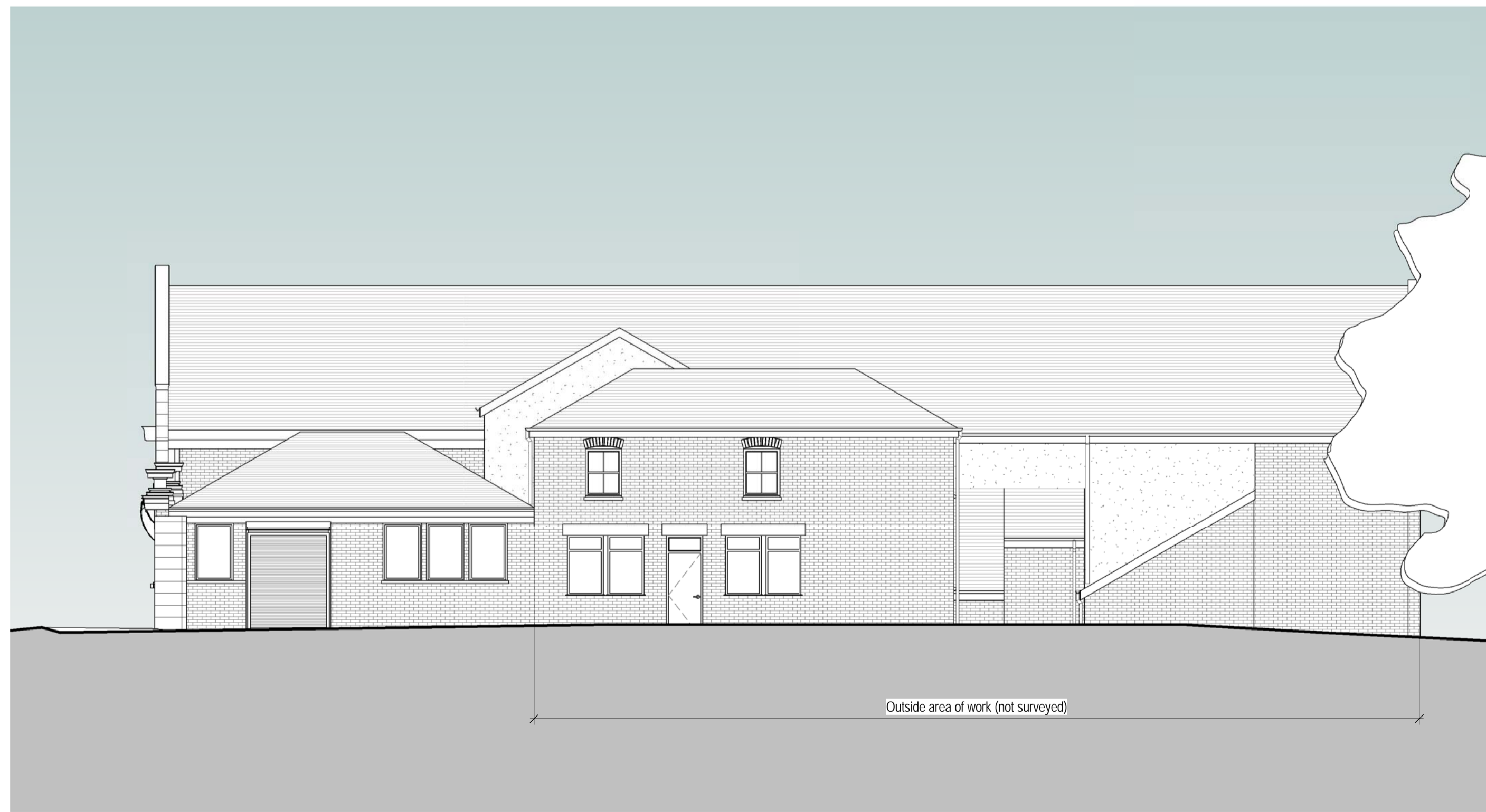
Side Elevation 1 : 100