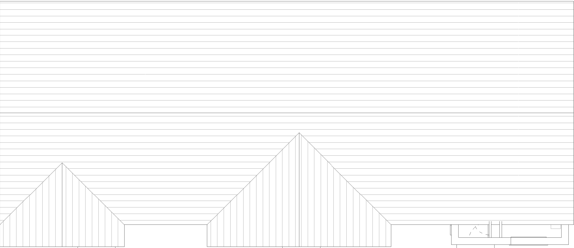
2 Roof Level 1 : 50

RESPONSIBILITY IS NOT ACCEPTED FOR OTHERS SCALING DIRECTLY FROM THIS DRAWING. DO NOT SCALE FROM THIS DRAWING. USE WRITTEN DIMENSIONS ONLY. ORIGINAL SHEET SIZE A1 THIS DRAWING IS PRODUCED FOR USE IN THIS PROJECT ONLY AND MAY NOT BE USED FOR ANY OTHER PURPOSE. THE ORIGINATOR ACCEPTS NO LIABILITY FOR THE USE OF THIS DRAWING OTHER THAN THE PURPOSE FOR WHICH IT WAS INTENDED IN CONNECTION WITH THIS PROJECT AS RECORDED IN THE 'PURPOSE FOR ISSUE' AND 'FILE STATUS CODE'. THIS DRAWING MAY NOT BE REPRODUCED IN ANY FORM WITHOUT PRIOR WRITTEN AGREEMENT. © CROWN COPYRIGHT AND DATABASE RIGHTS - ORDNANCE SURVEY LICENCE NUMBER 100019340.