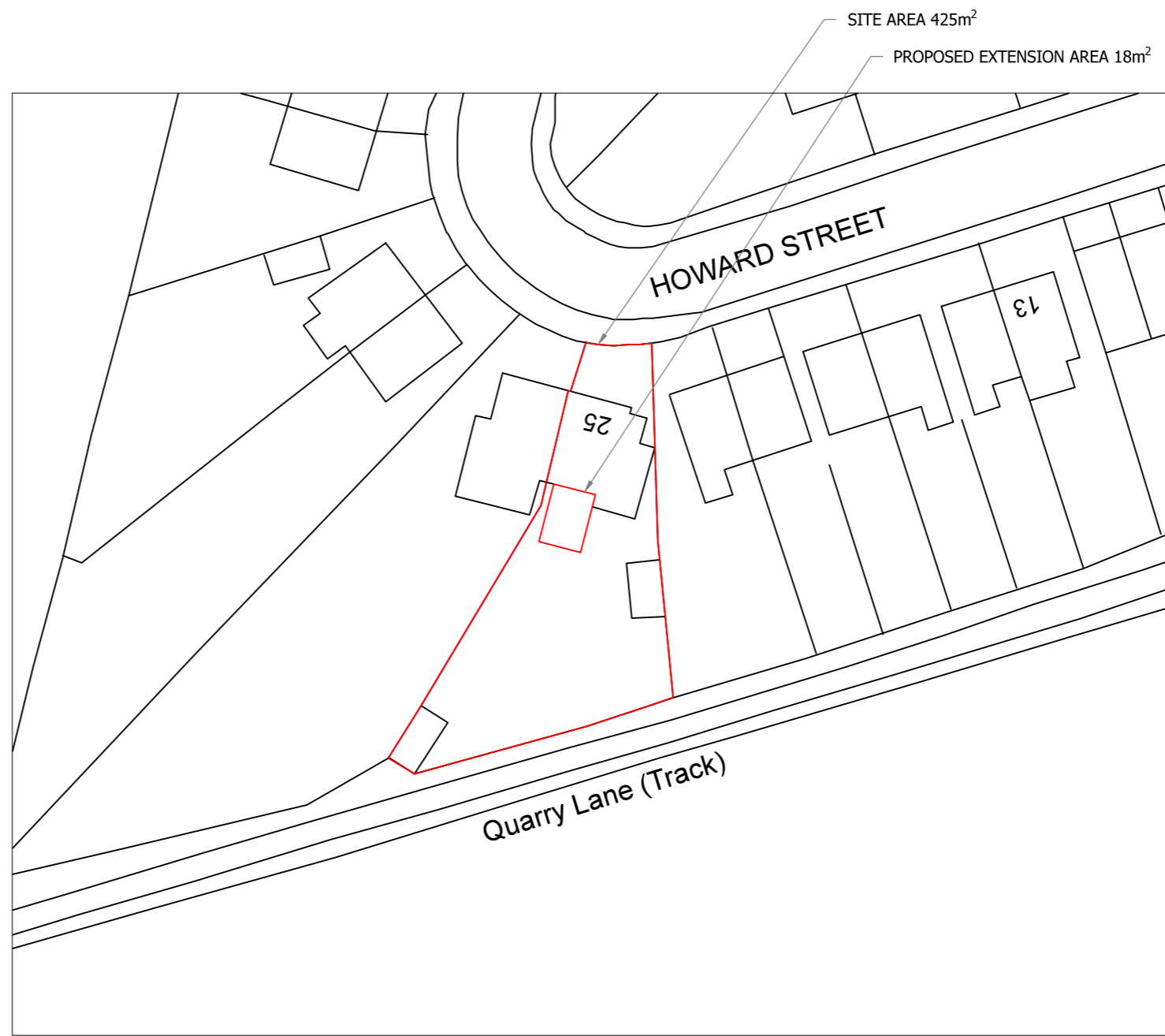
SITE PLAN SCALE 1:500 AT A3