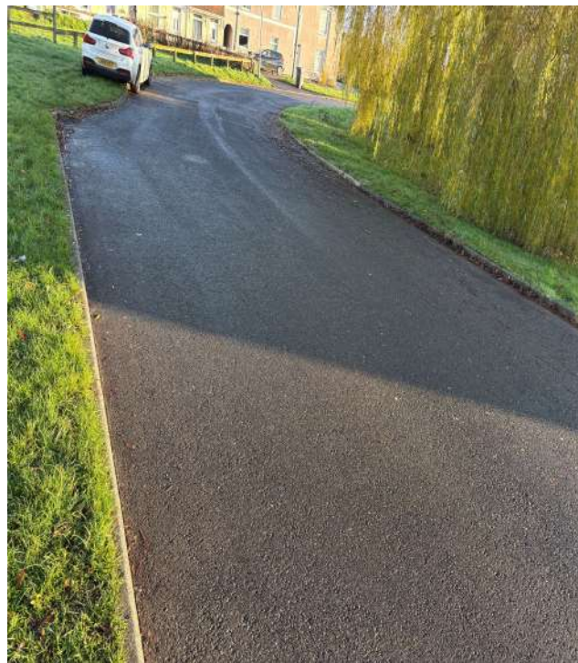
10 – Carriageway in good condition.