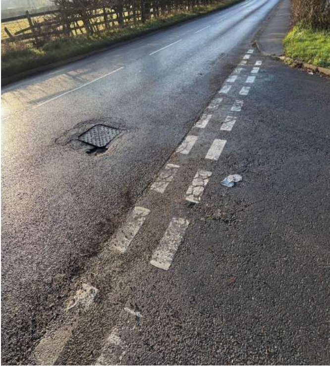
17 – Manhole lid in wheel line, in poor condition lid rocking.