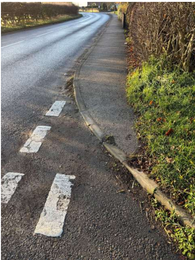
15 – Minor damage to kerbs at drop crossing from the south.