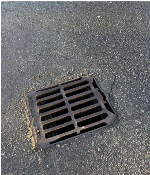
9 – Further photo of gully, crack in tarmac to the side of lid.