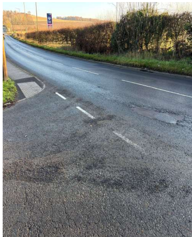
2 – Patches of reinstated tarmac highway cracking and rutting.