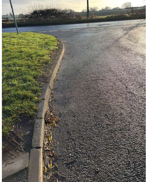
14 – Chipping to kerbs at vehicle crossing.