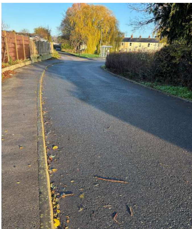
3 – Highway and Footpath in good condition.