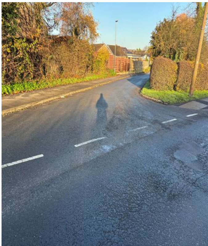
1 – Entrance to bus stop off High Street onto Crabtree drive.