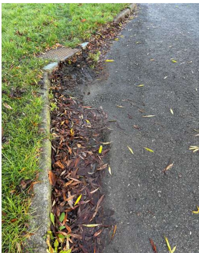
11 – Gully blocked, needs to be cleared from debris.