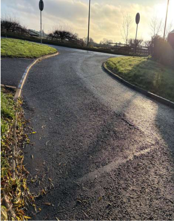
13 – Existing Joint in tarmac, minor cracking.