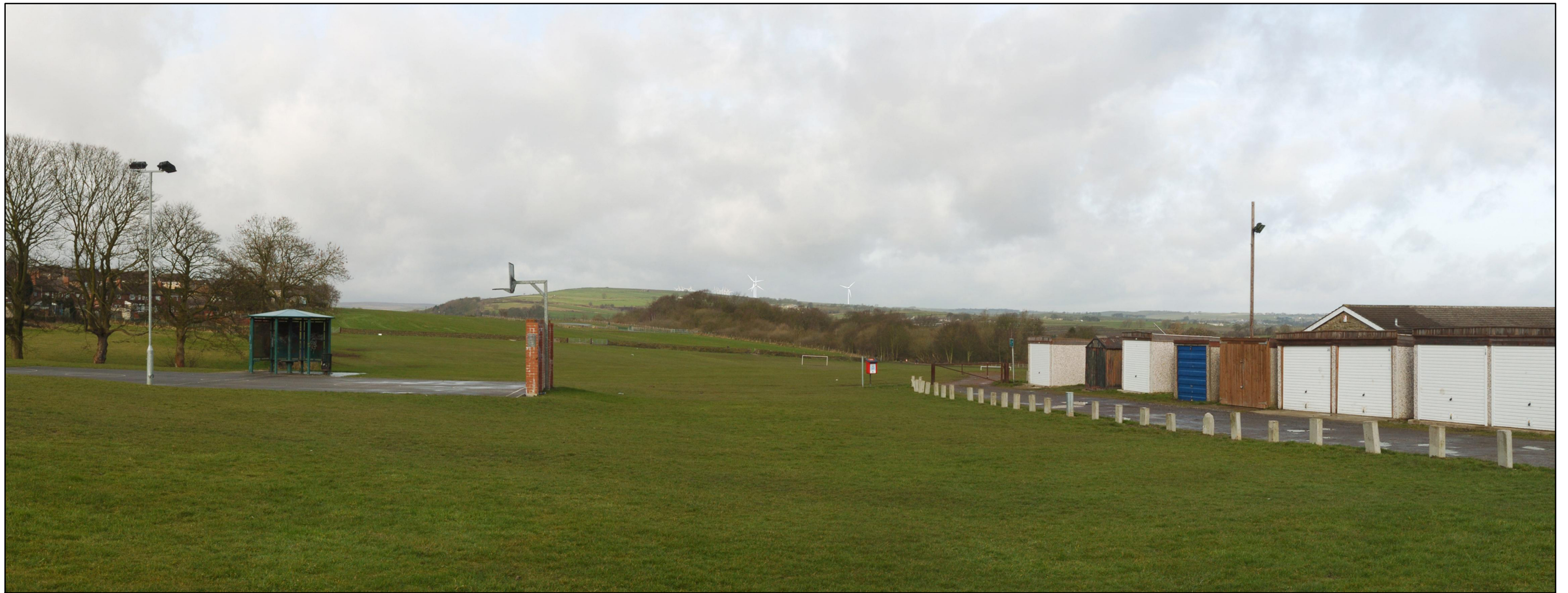
Photomontage showing proposed development from viewpoint