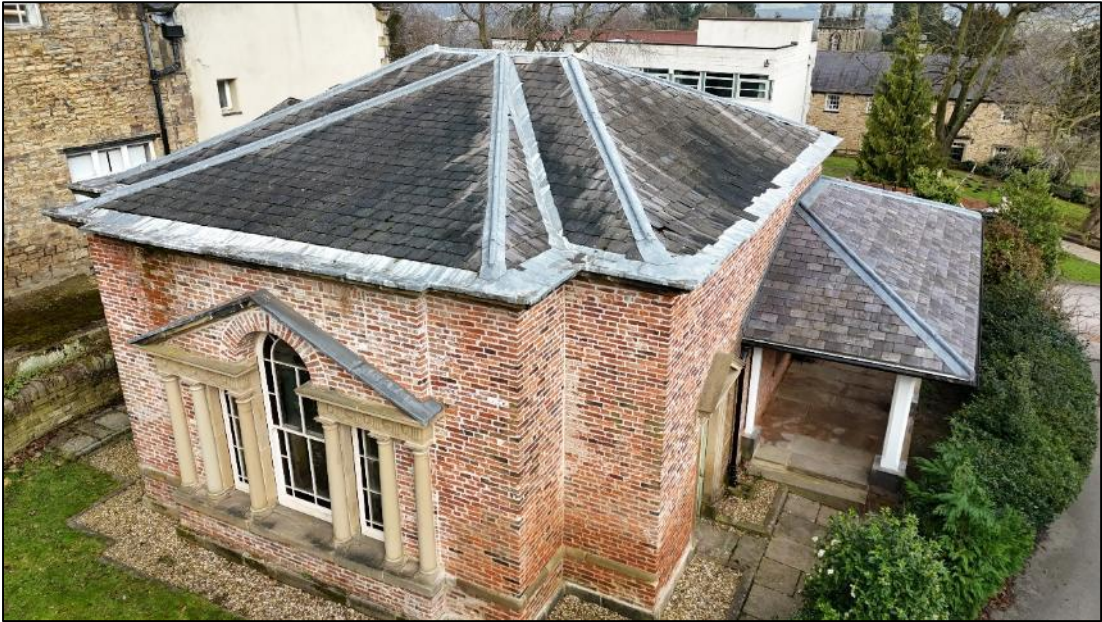
Plate 4. Veranda on southeast elevation of Gun Room