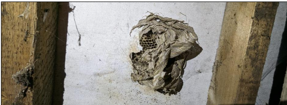
Plate A2.2. Damage to a breathable roofing membrane adjacent to a wasp nest

Traditional bituminous Type 1F roofing felt is a non-breathable product and therefore ventilation is required. Sufficient ventilation can be usually be achieved, even in buildings with vaulted ceilings, however, some consideration during the design stage is required. Products to increase the ventilation within roofs where bituminous Type 1F felt has already been installed are also available.