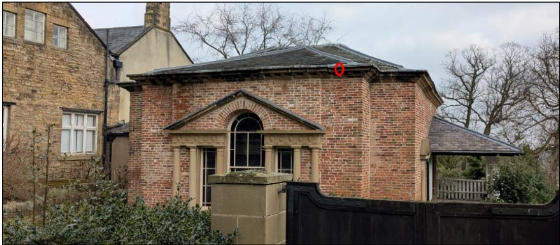
Plate 9. Gap behind fascia board on northeast elevation of Daisy Cottage