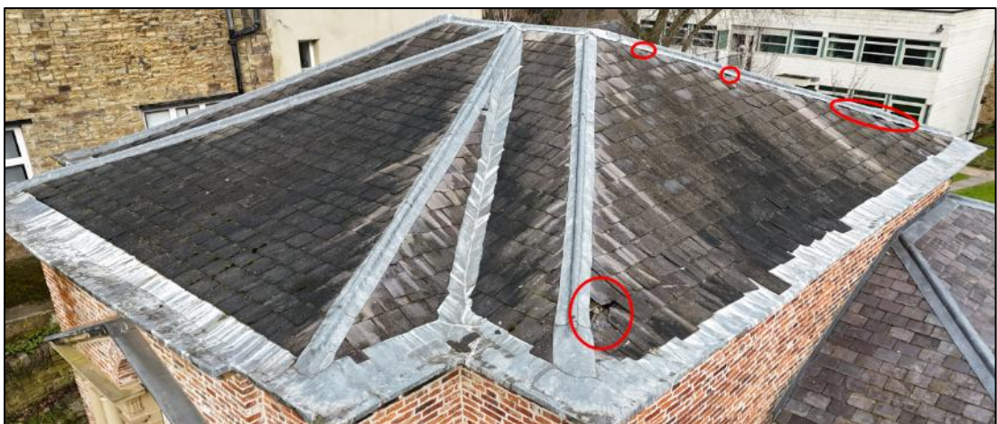
Plate 7. Missing slates and lifted flashing on main roof