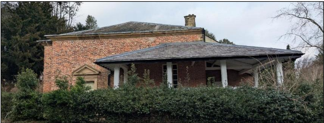
Plate 5. Daisy Cottage and veranda on northeast elevation of Gun Room