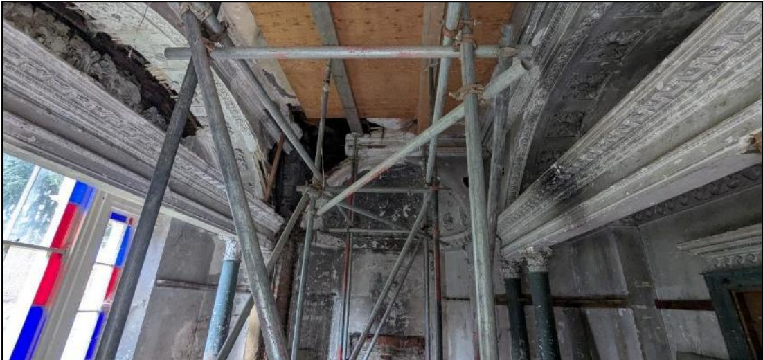
Plate 11. Interior of veranda roof