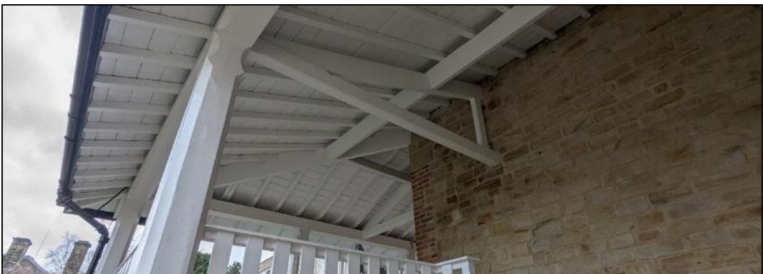
Plate 12. Gap at top of sarking on underside of veranda roof, potentially allowing bats access to crevice space behind flashing.