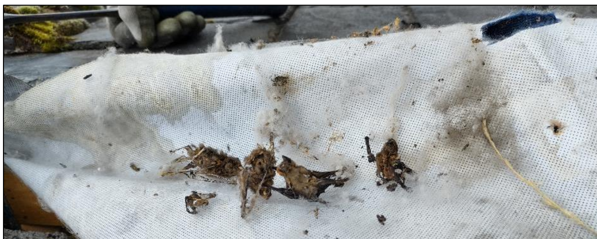
Plate A2.1. Four dead pipistrelles tangled in breathable roofing membrane

Although a new roof might be considered to lack potential bat access points, that is often not the case. Roofs covered with stone slates almost always have gaps large enough to be accessed by bats, this is often also the case where imitation stone slates are used. On older buildings the uneven roof timbers and/or building design also often results in gaps on wall tops and between slates. Even on new builds it is often possible for bats to access potential roosts via features such as dry verge capping. Some bats can access a space no wider than a biro pen, therefore it is not surprising that they can find their way into most buildings.