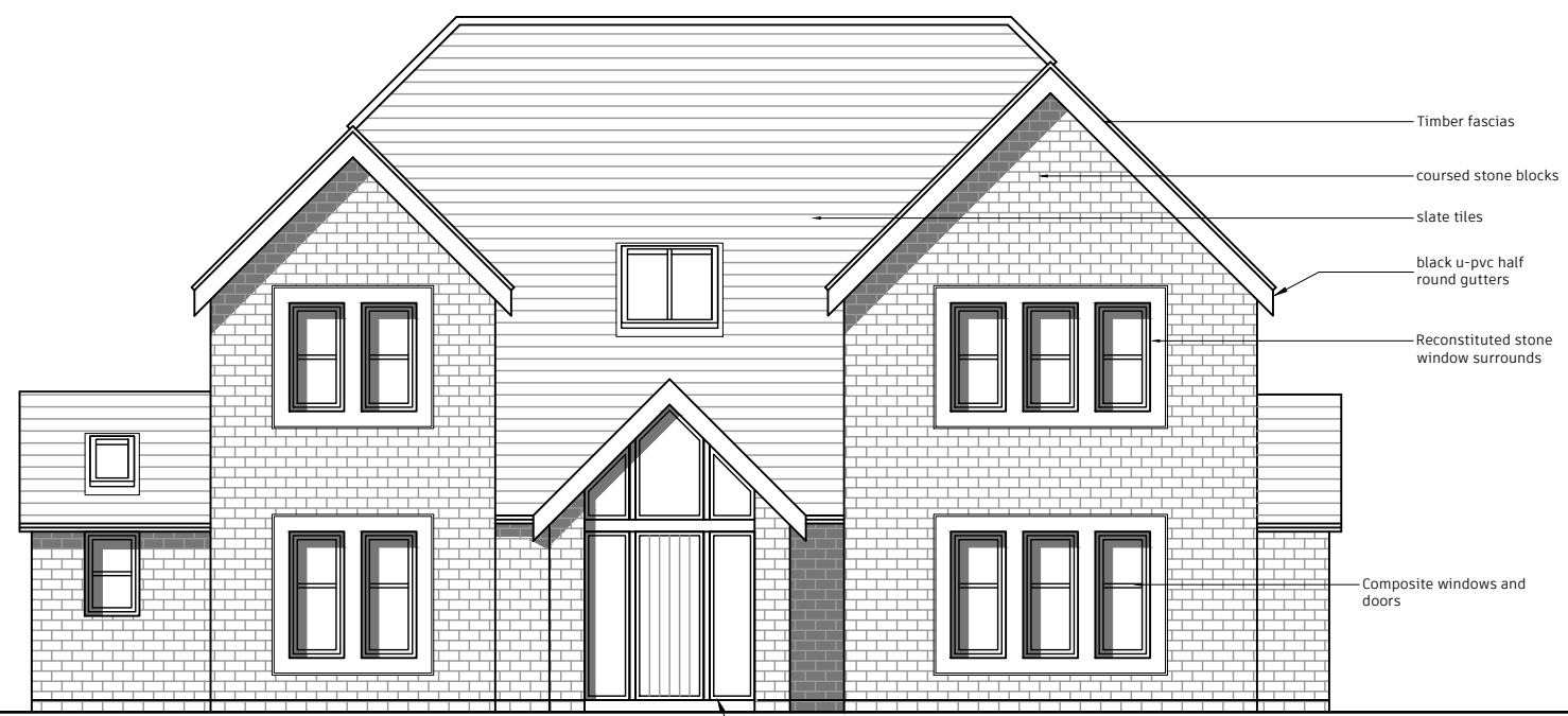
Front Elevation (North)

These drawings are for planning or building regulation purposes only and not to be used as construction drawings other than for guidance. All dimensions to be checked on site prior to construction This drawing remains the copyright of the Architectural designer and no portion should be reproduced without their permission.