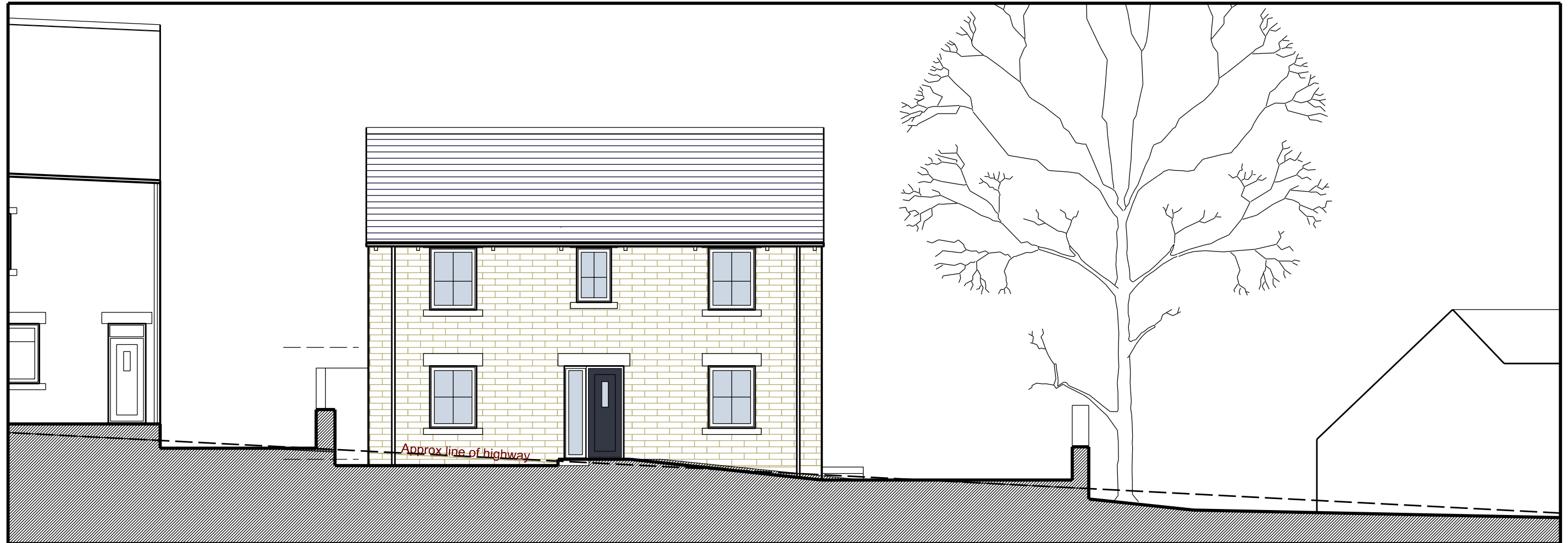
North Elevation - Proposed