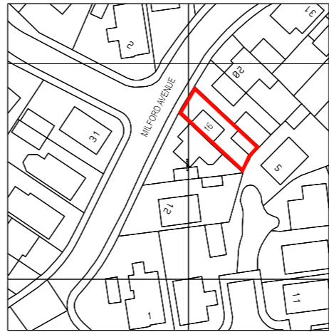
○ SITE LOCATION PLAN 1:1250 N