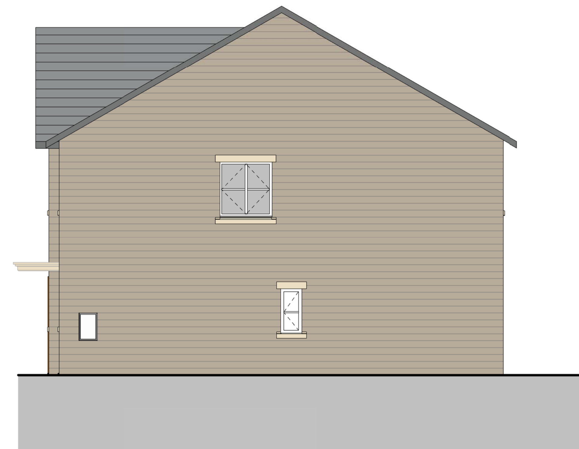
2 Side Elevation 01 1 : 50