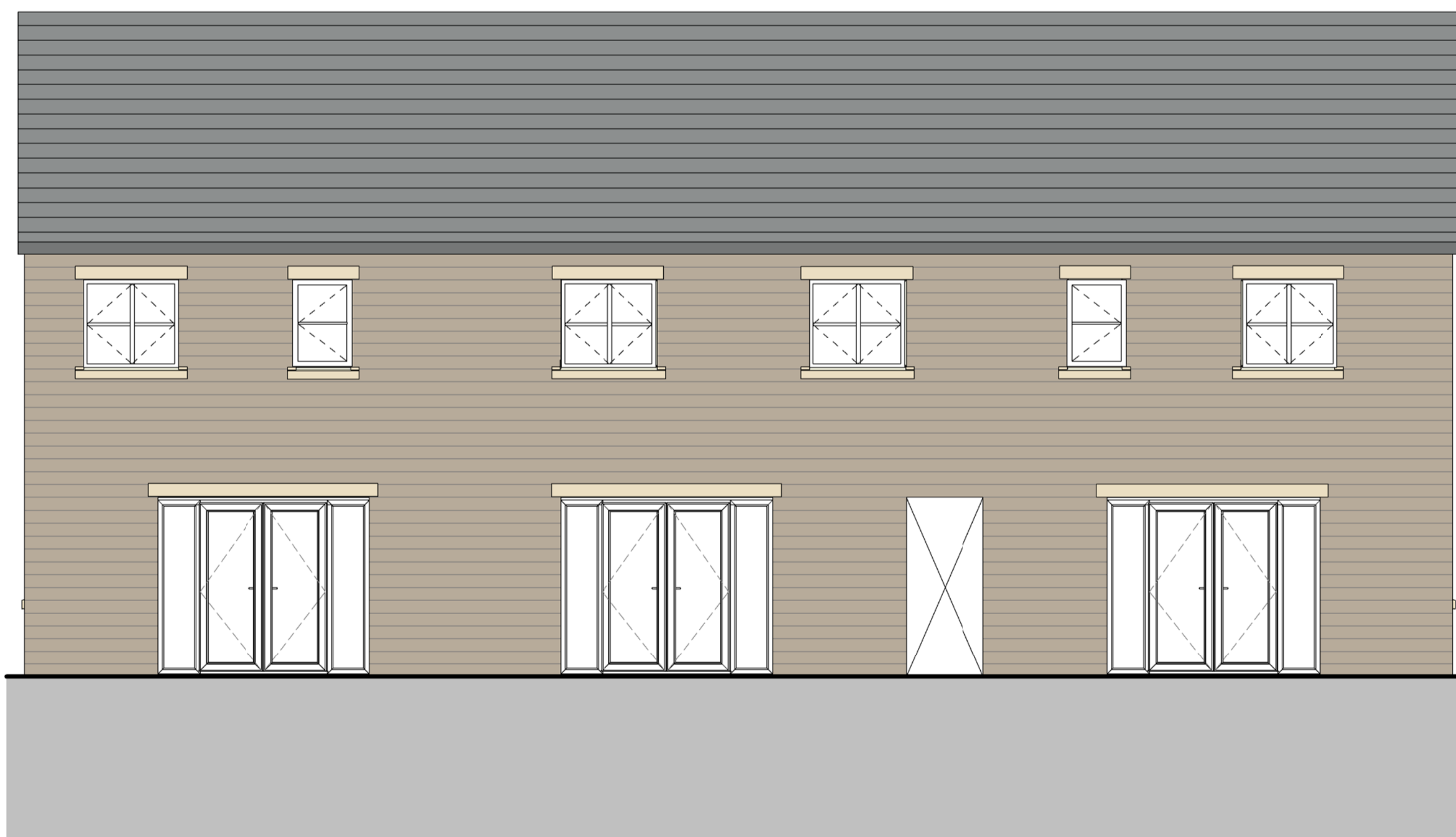
3 Rear Elevation 1 : 50