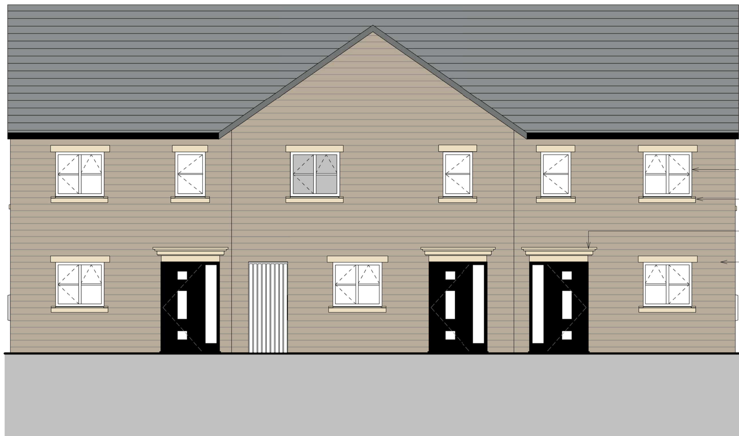
1 Front Elevation 1 : 50