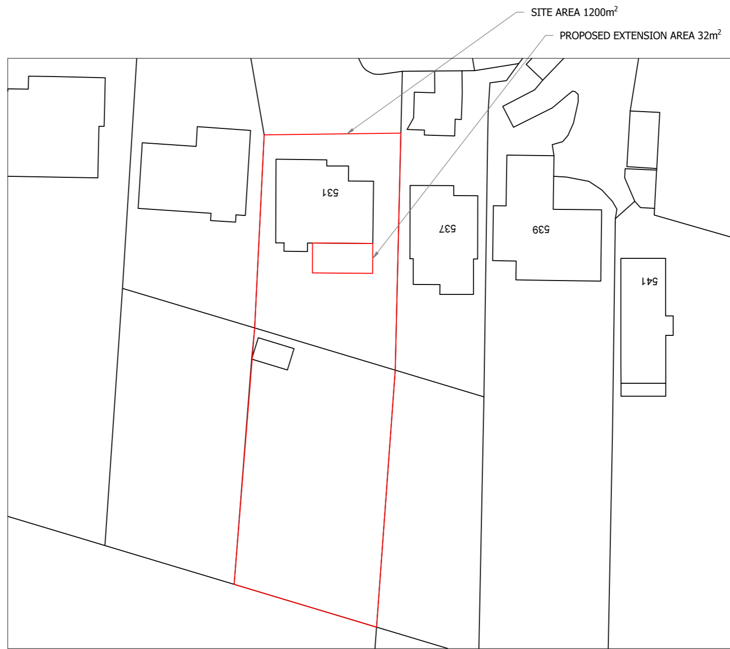
SITE PLAN SCALE 1:500 AT A3