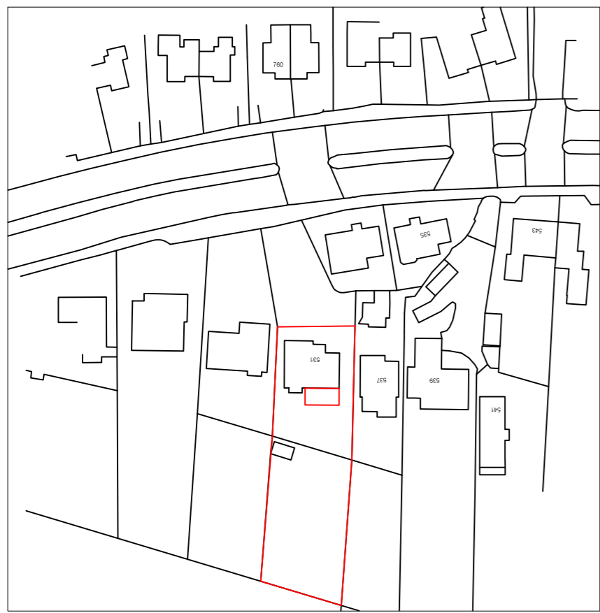
LOCATION PLAN SCALE 1:1250 AT A3