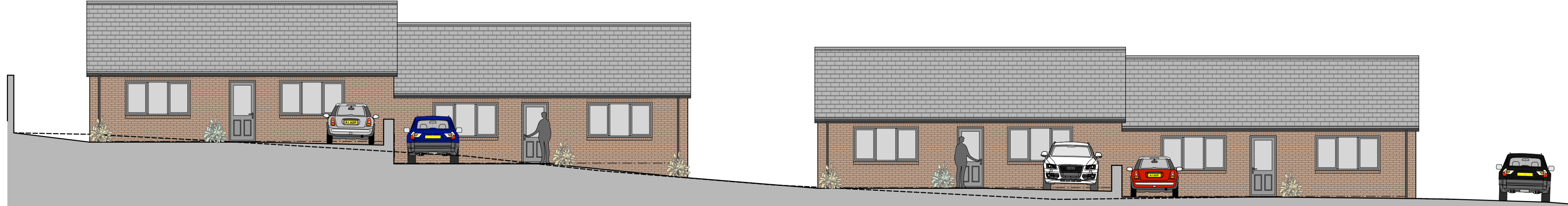
street scene elevation