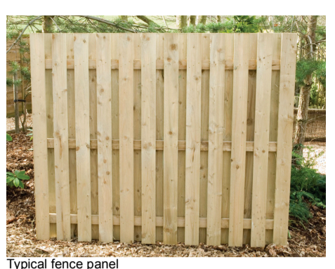
Typical fence panel