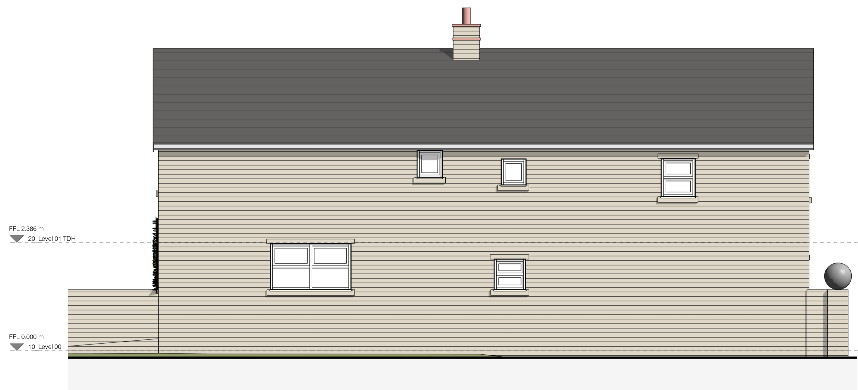
C - EXISTING REAR ELEVATION - TDH 1 : 50