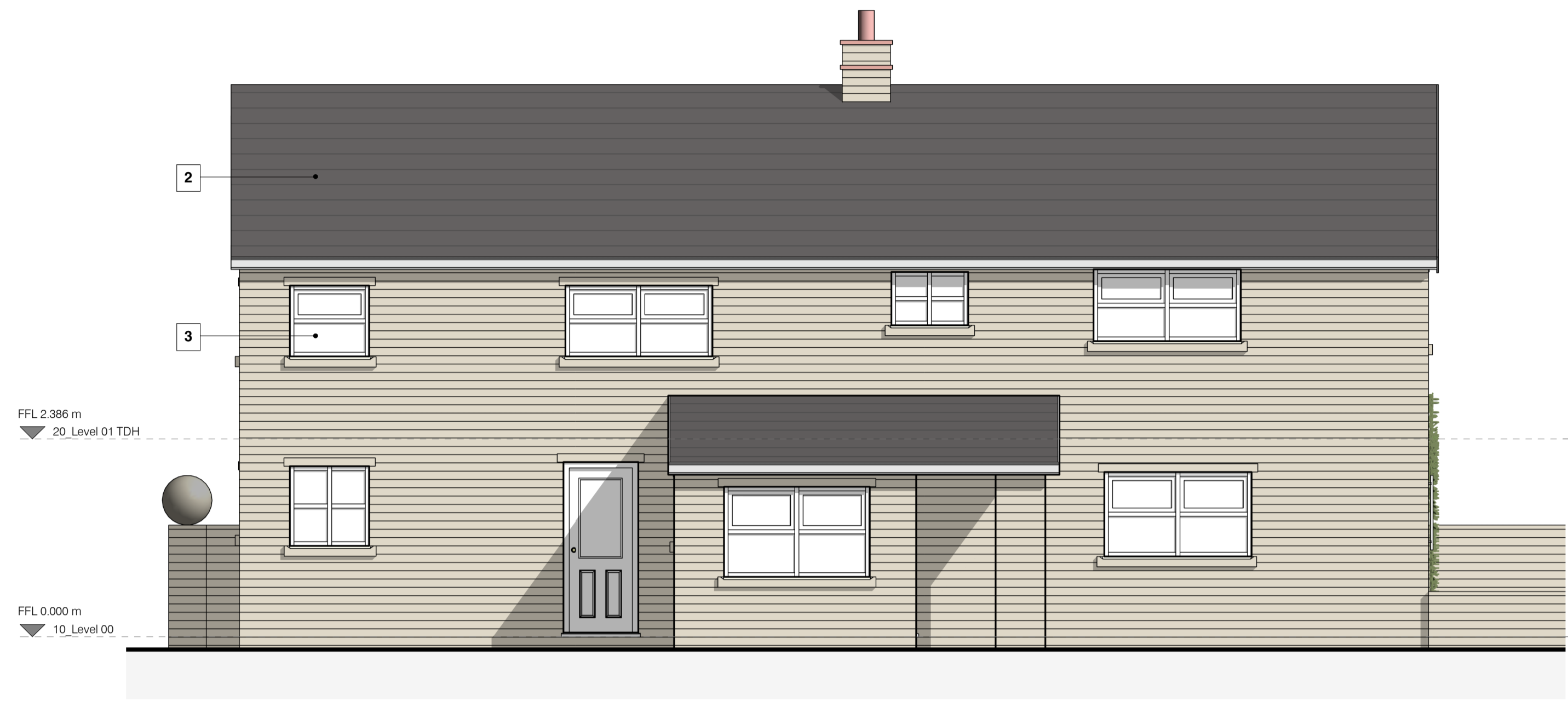
A - EXISTING FRONT ELEVATION - TDH 1 : 50