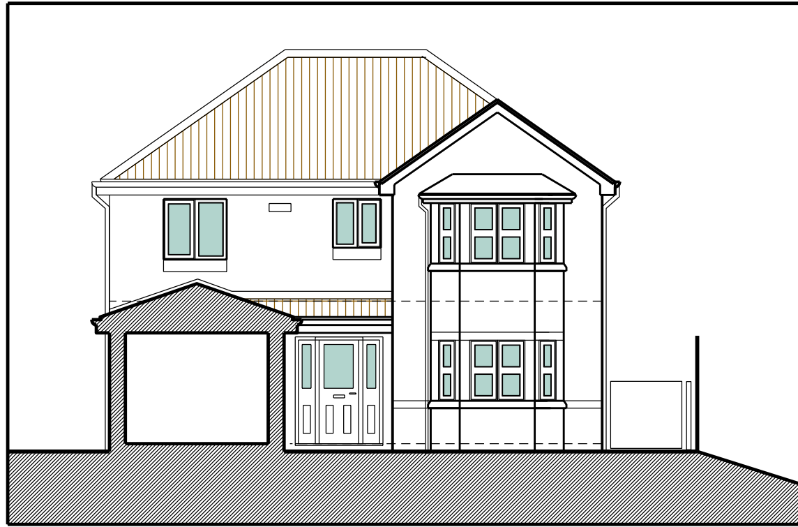
North Elevation - Existing