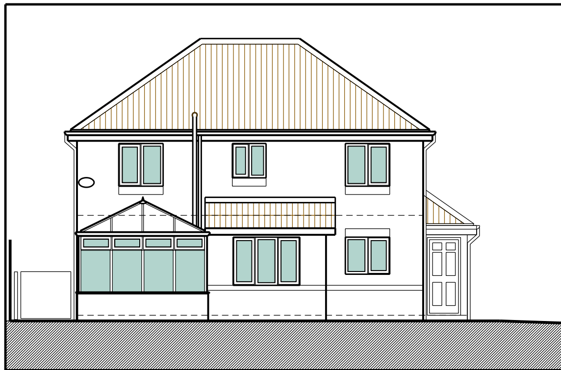
South Elevation - Existing