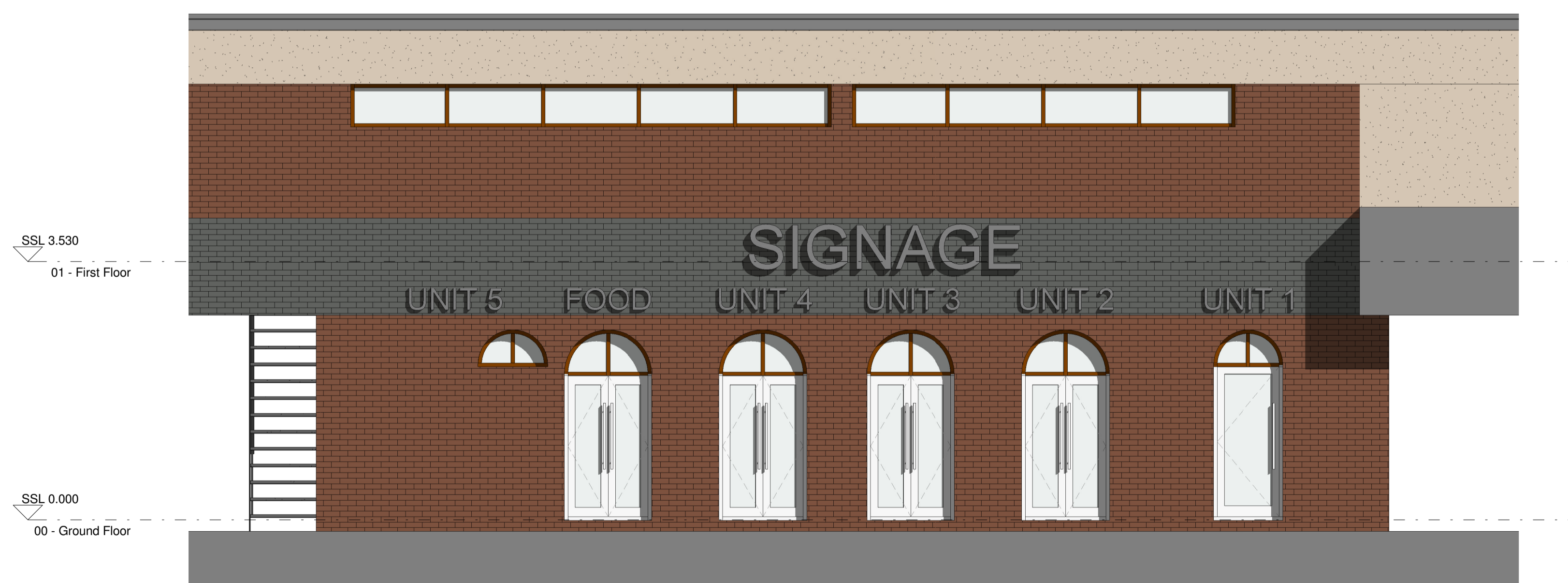
South Elevation 1 : 50