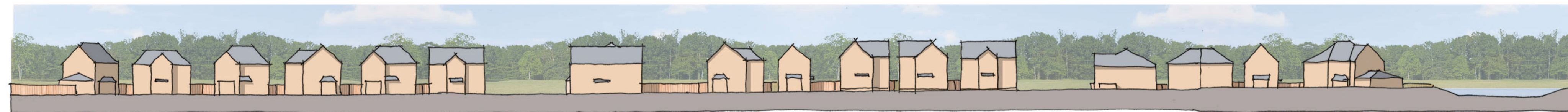
00_Site Section D-D 1:250