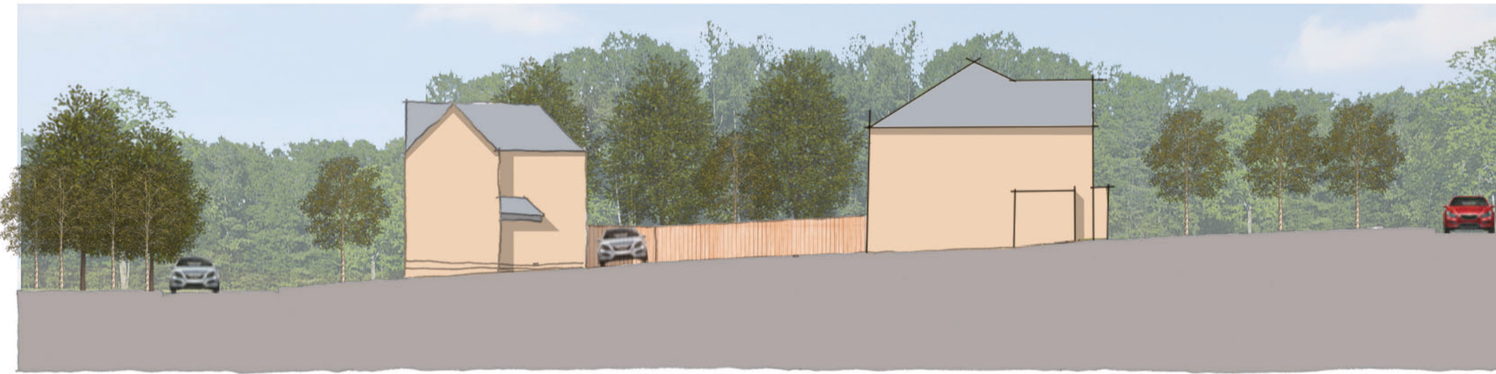
00_Site Section C-C 1:250