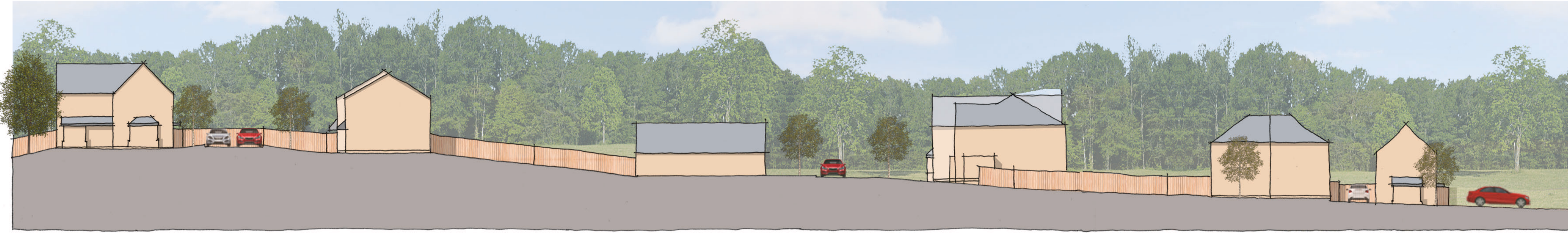
00_Site Section A-A 1:250