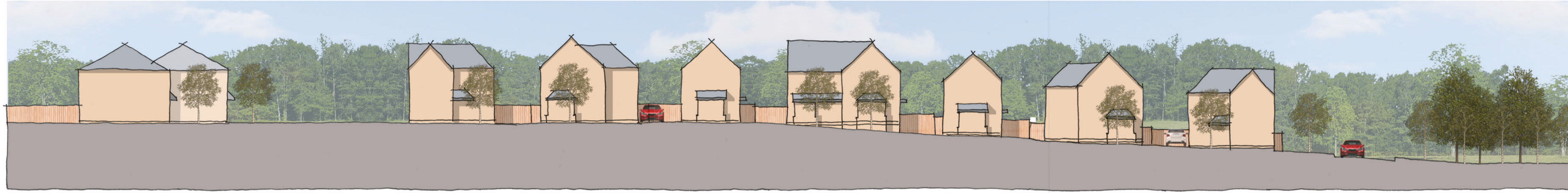
00_Site Section B-B 1:250