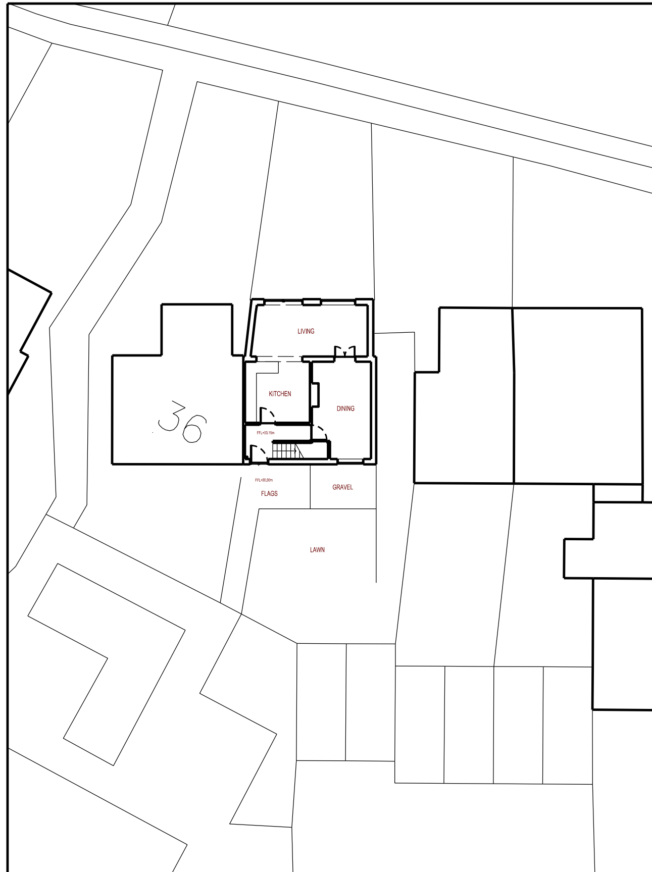
Site Plan - Existing