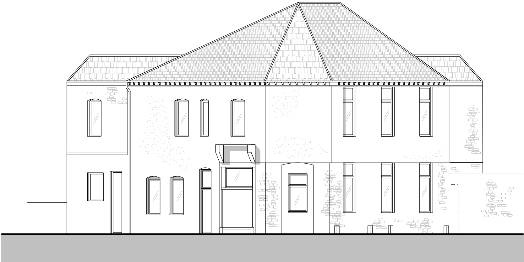
EXISTING SOUTH-WEST ELEVATION