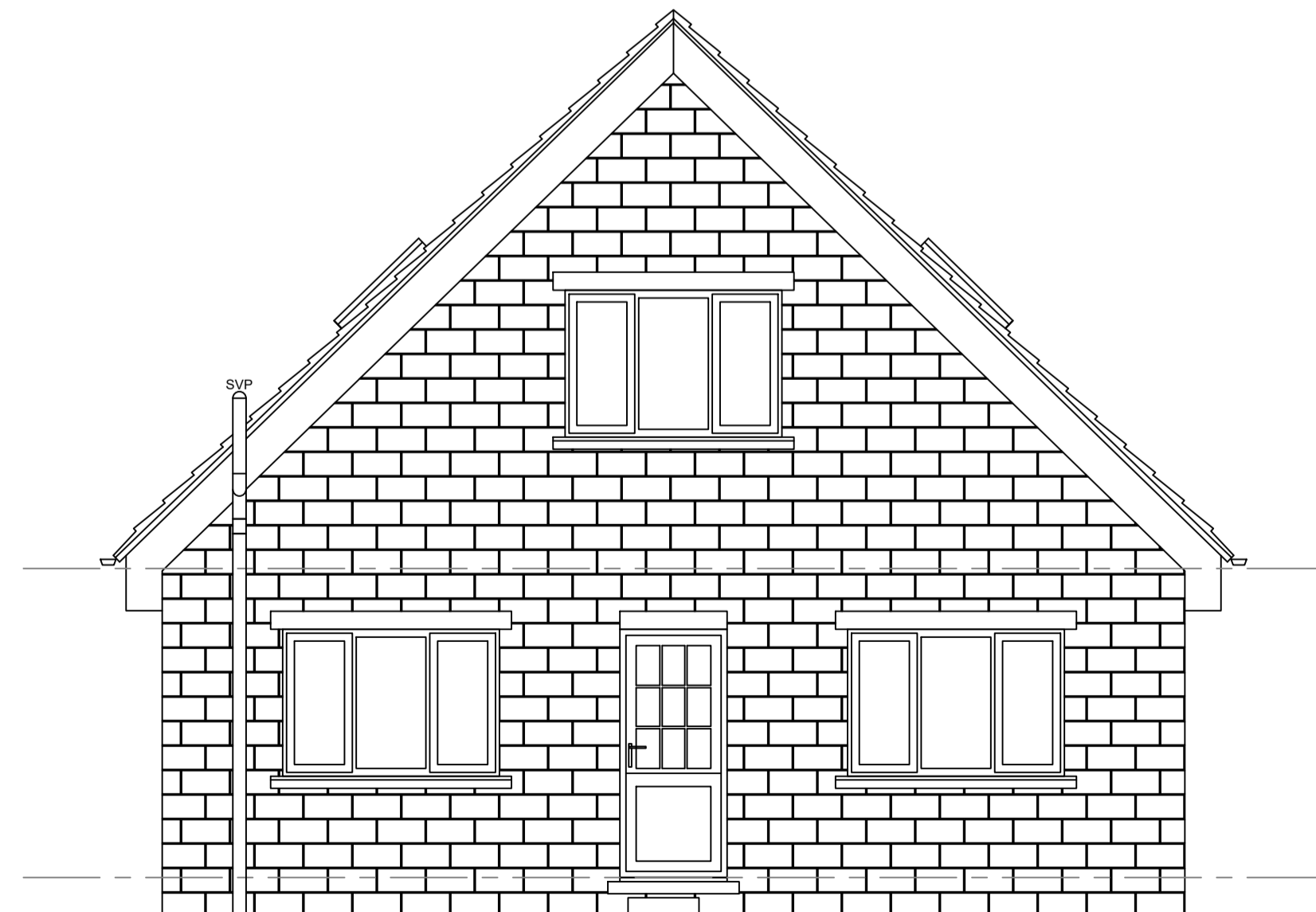
EXISTING REAR ELEVATION - scale 1:50