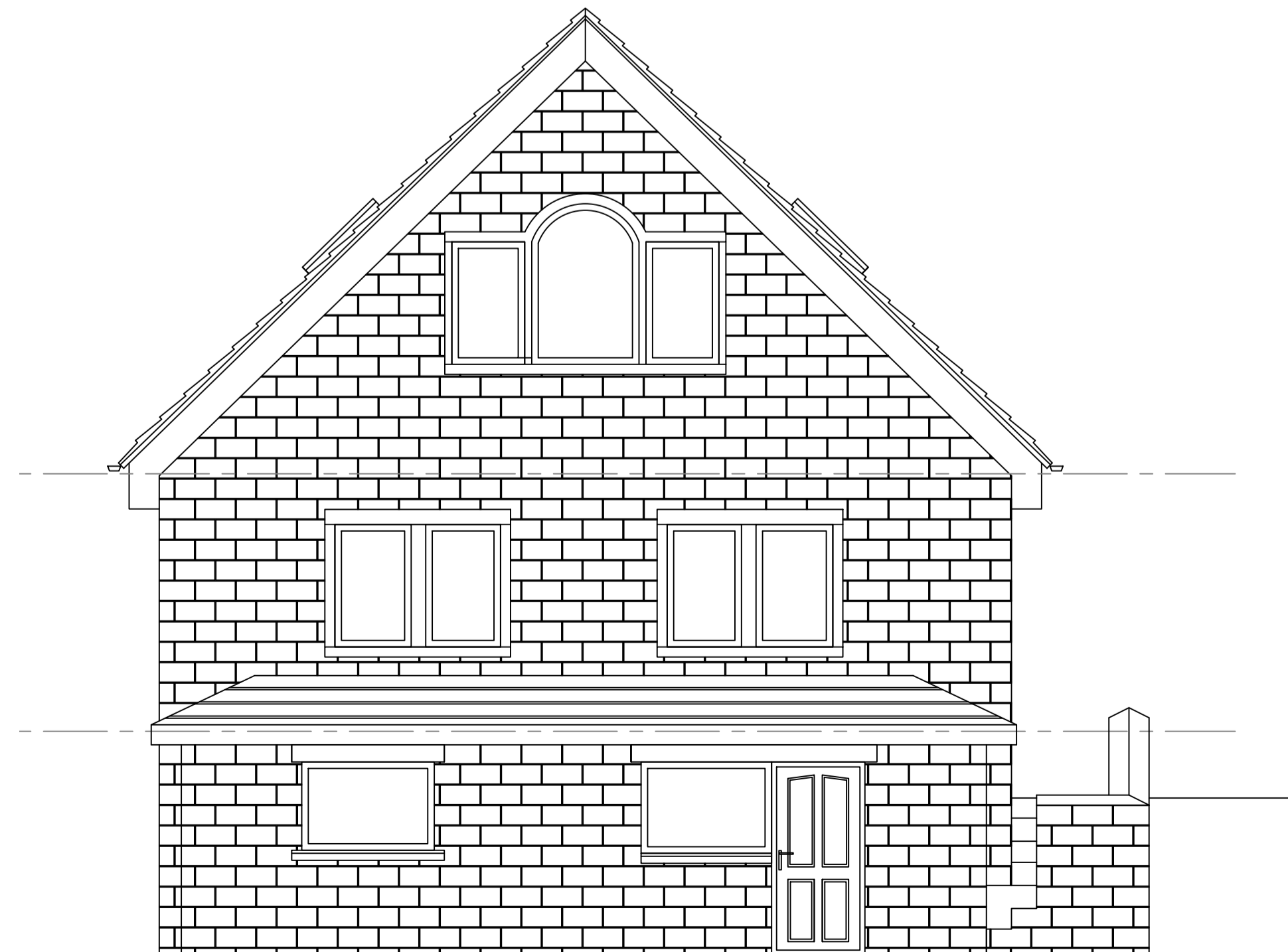
EXISTING FRONT ELEVATION - scale 1:50