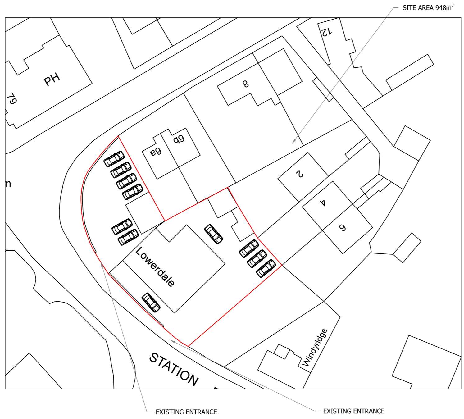
SITE PLAN SCALE 1:500 AT A3