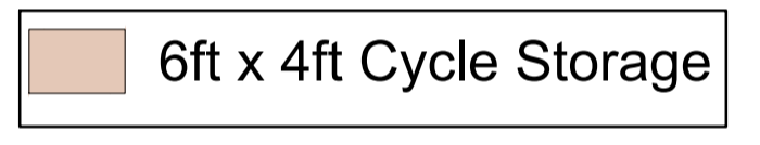
6ft x 4ft Cycle Storage