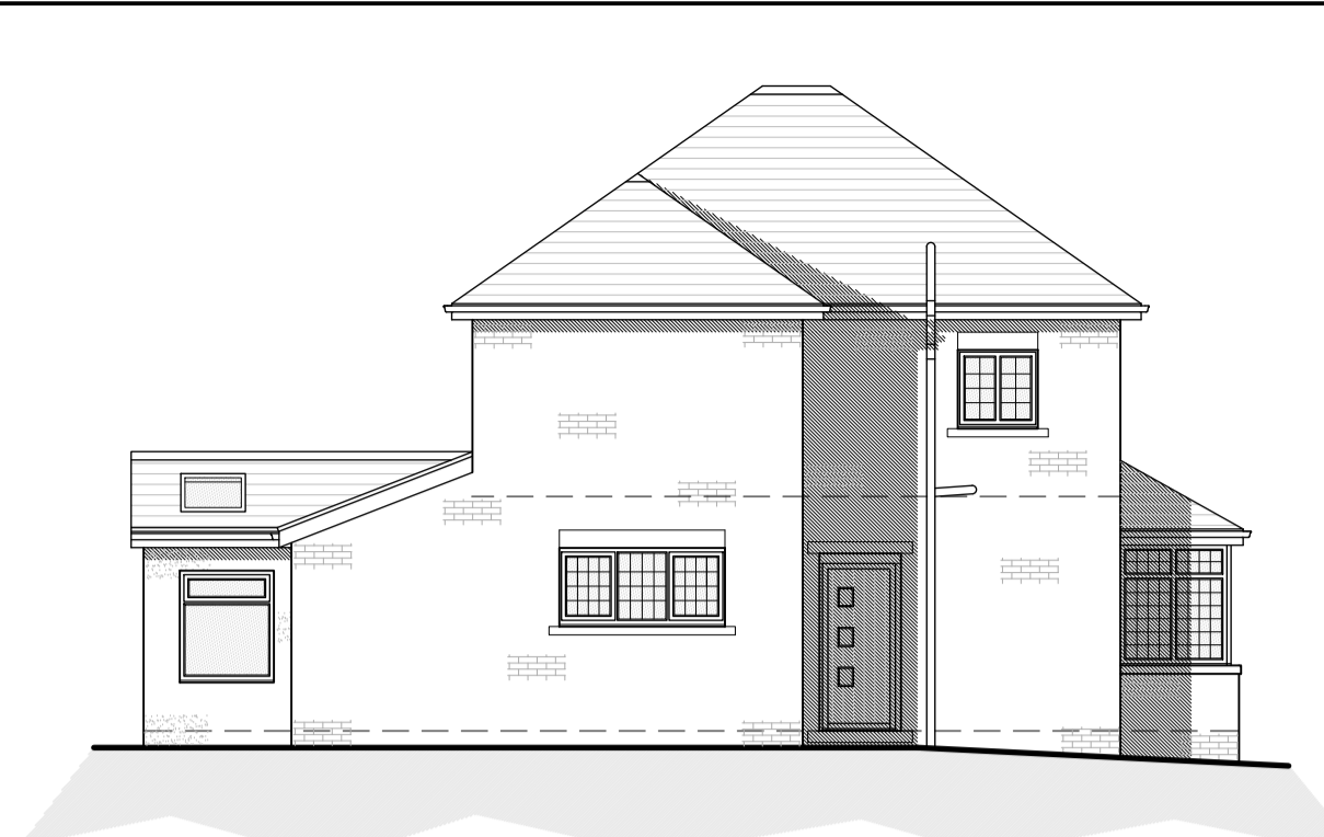
Existing South West Facing Side Elevation Scale 1:100