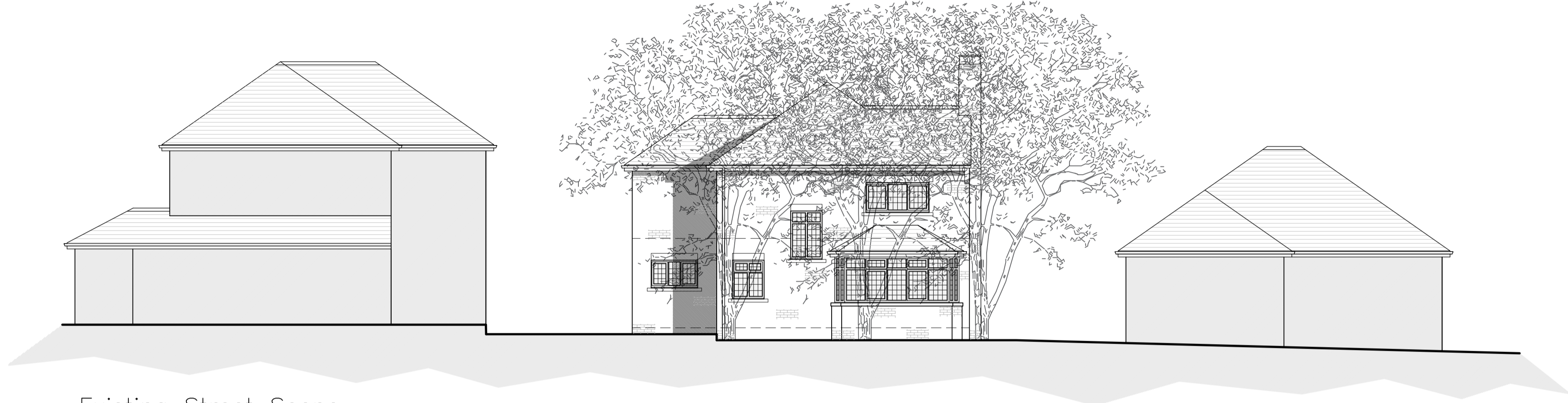
Existing Street Scene Scale 1:100

NOTES No dimensions to be scaled. IF IN DOUBT ASK. All dimensions must be checked and verified on site by the Contractor prior to the commencement of works and Hinchliffe Architecture & Design Ltd. to be notified of any discrepancies. The copyright of these drawings remains the property of Hinchliffe Architecture & Design Ltd. They must not be reproduced in any way without prior written consent from the originator (Hinchliffe Architecture & Design Ltd.)