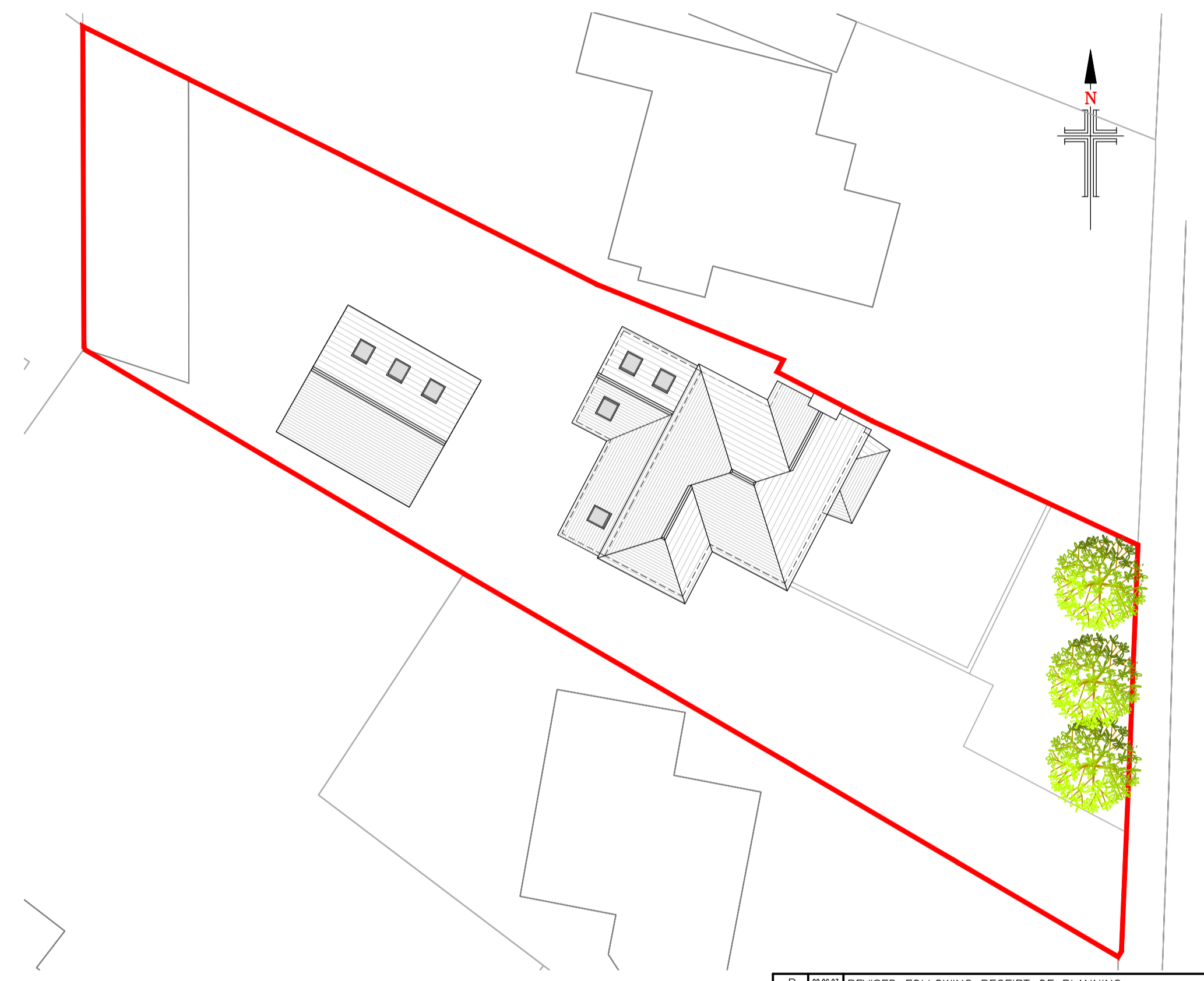
Existing Site Layout Scale 1:200