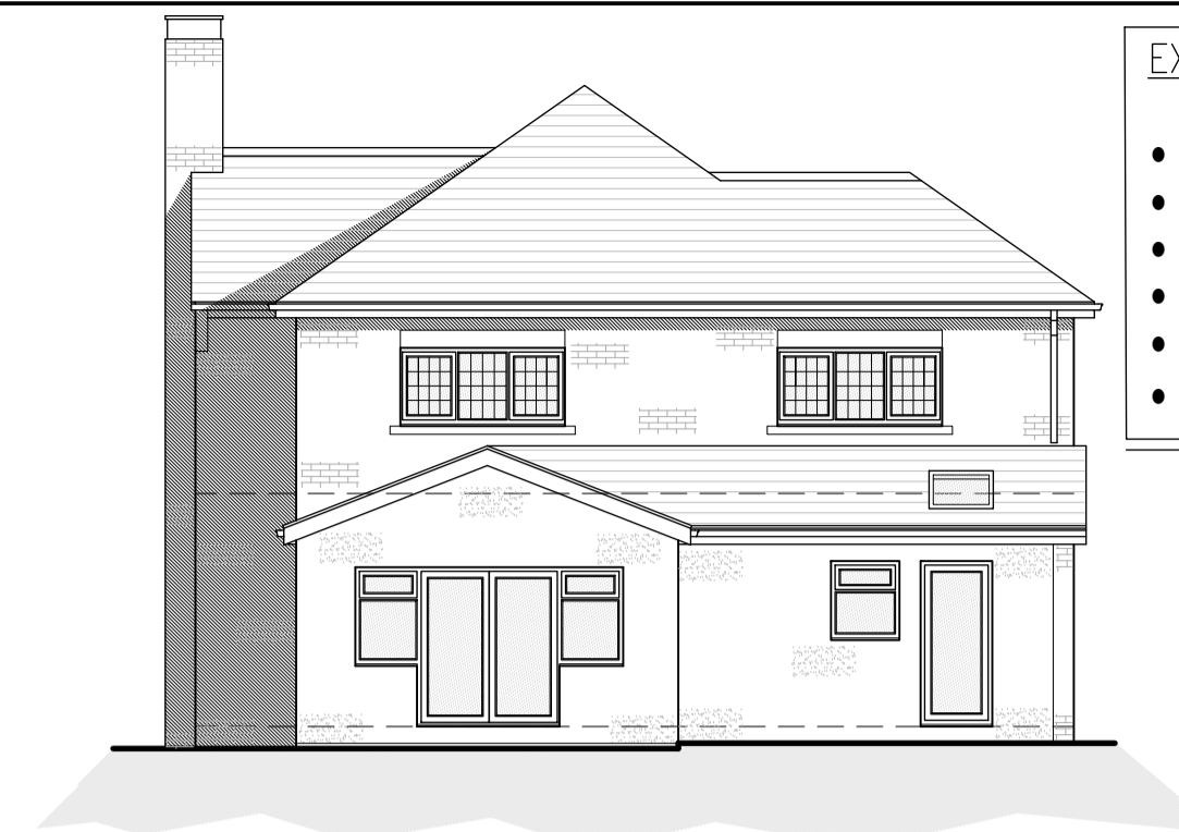
Existing North West Facing Rear Elevation Scale 1:100