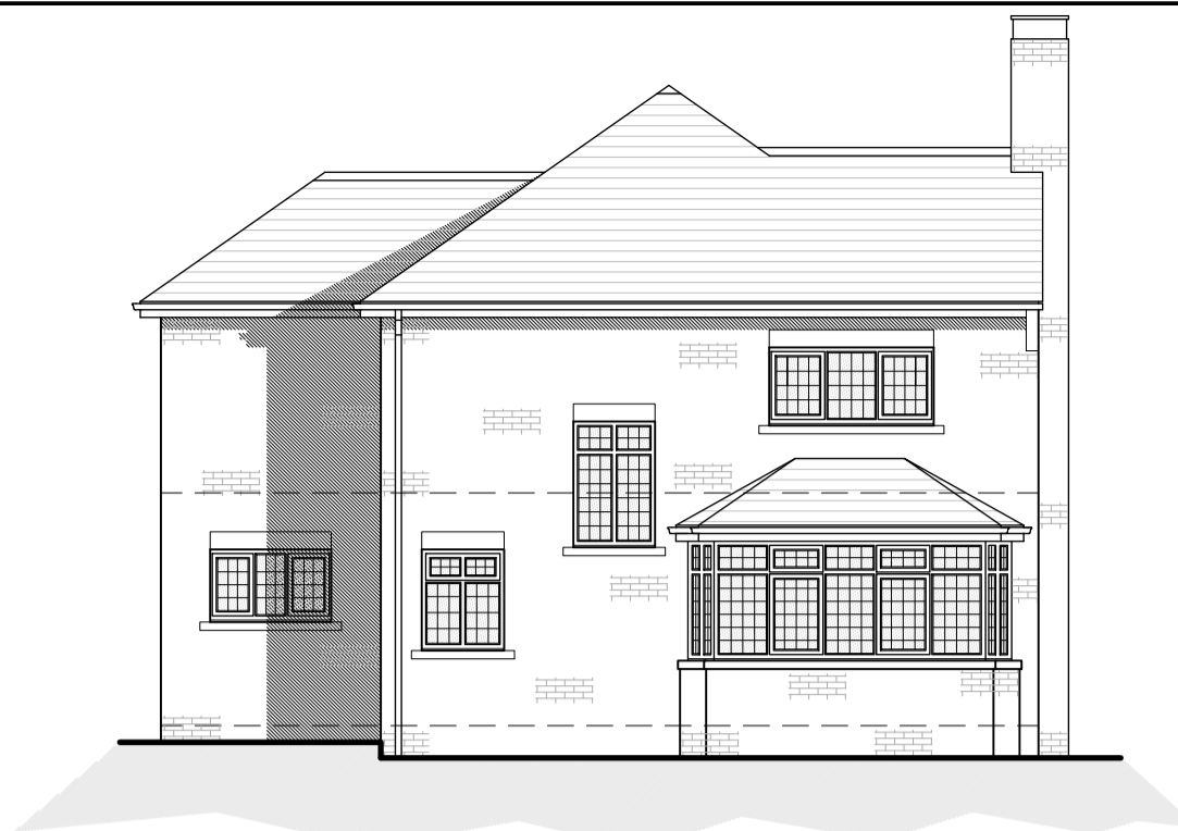
Existing South East Facing Front Elevation Scale 1:100