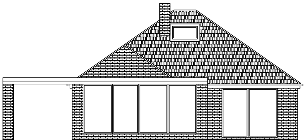
EXISTING REAR ELEVATION SCALE 1:100 AT A3