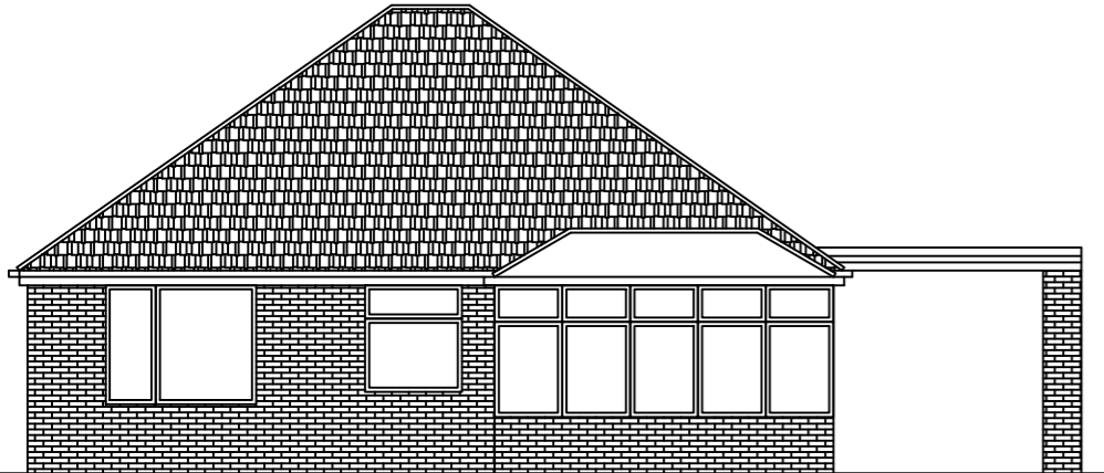
EXISTING FRONT ELEVATION SCALE 1:100 AT A3