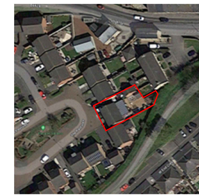
AERIAL IMAGE

Legend Extents of Single Storey Extension Extents of Internal Remodel Extents of Double Storey Extension Dashed Red Line denotes the extent of the DEMOLITION