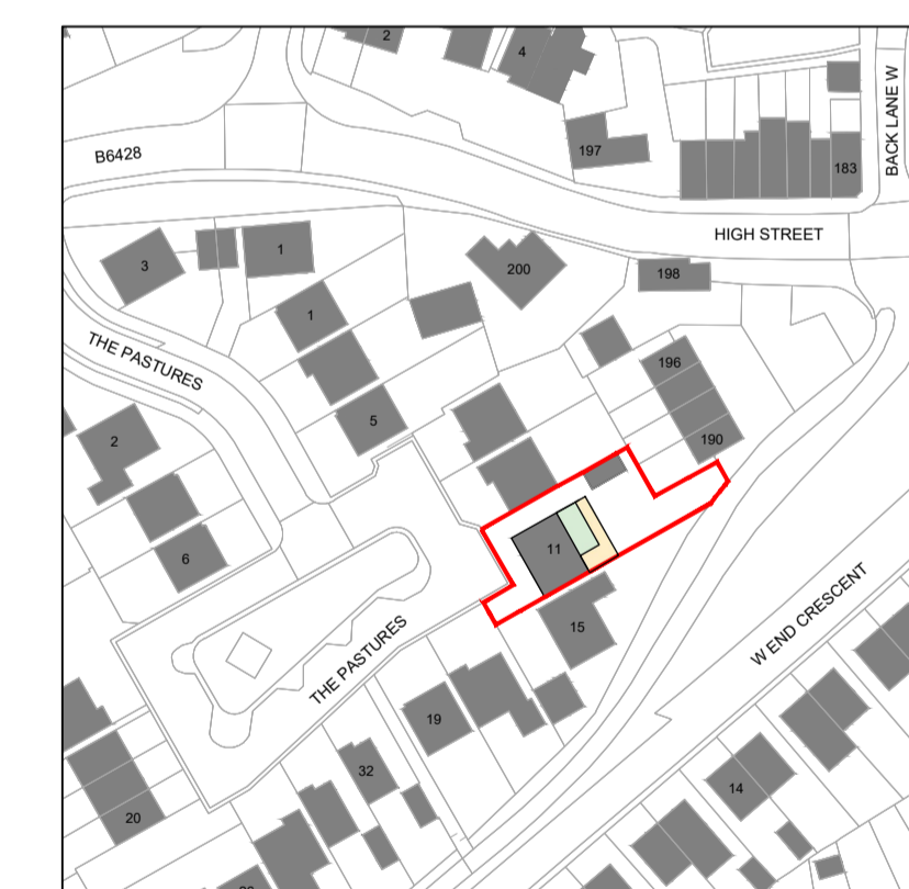
Proposed Block Plan Scale - 1:1250 Applicants site boundary edged in 'Red'. Map Number: TORQM2209114116210