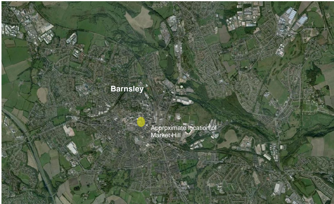
Extract from Google Earth

The site is located in Barnsley town centre and is very well serviced by a large number of local amenities.