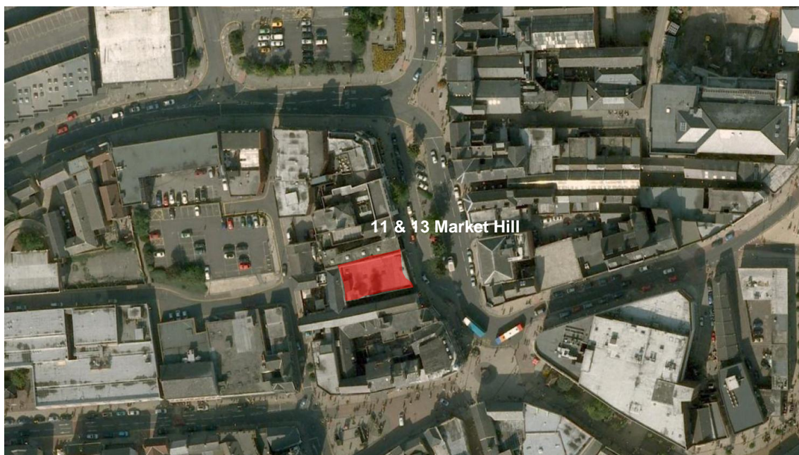
Extract from Google Earth

Market Hill is a busy thoroughfare to the north of the pedestrianised Queen Street. 11 & 13 Market Hill is serviced from the public highway. Market Hill is within a conservation area.