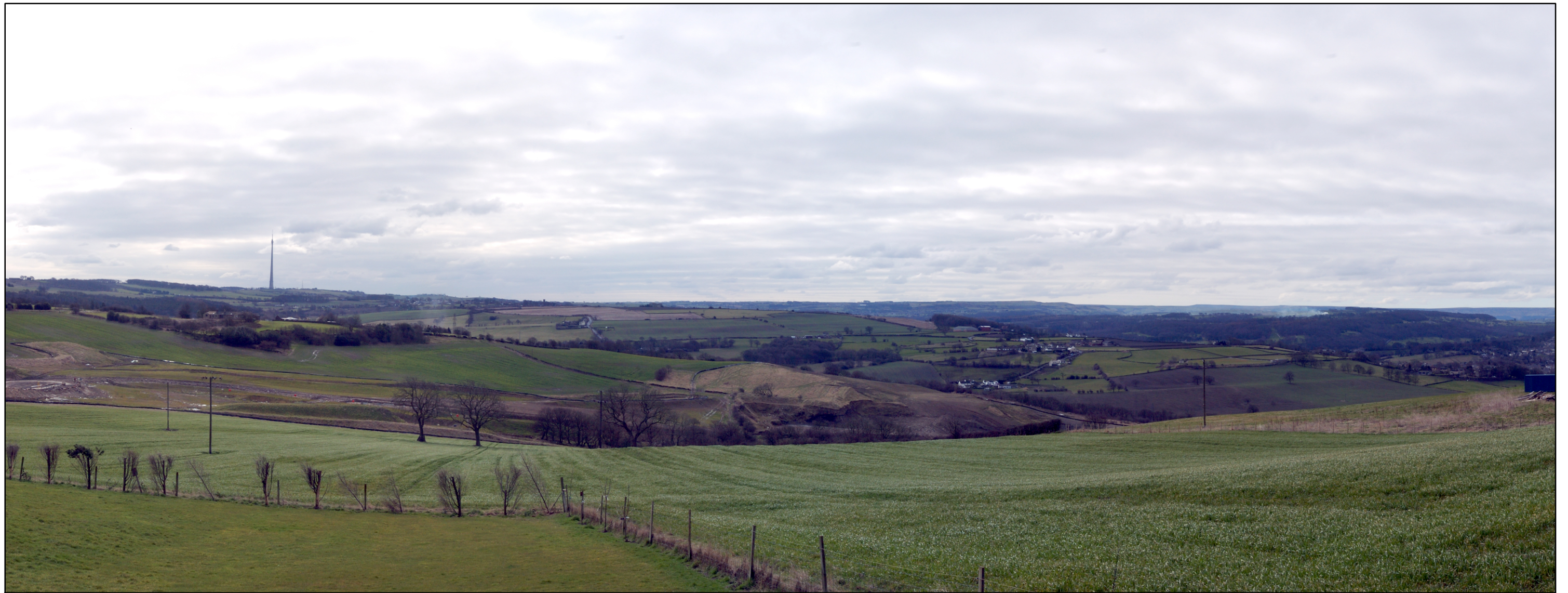
Existing view from viewpoint