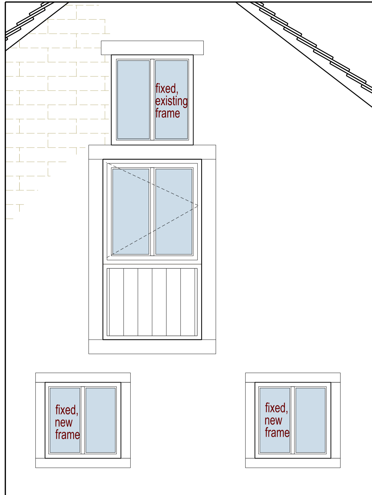
North Elevation, 1:20