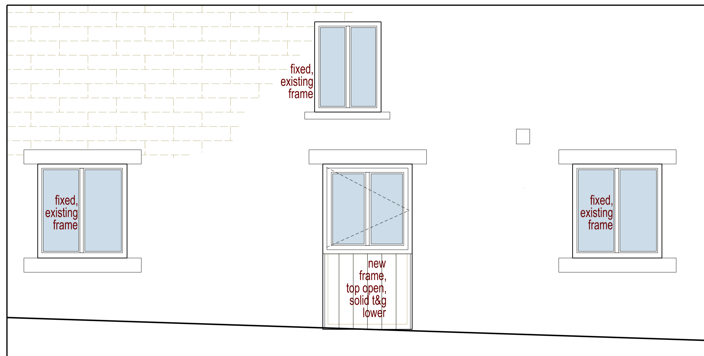
West Elevation, 1:20