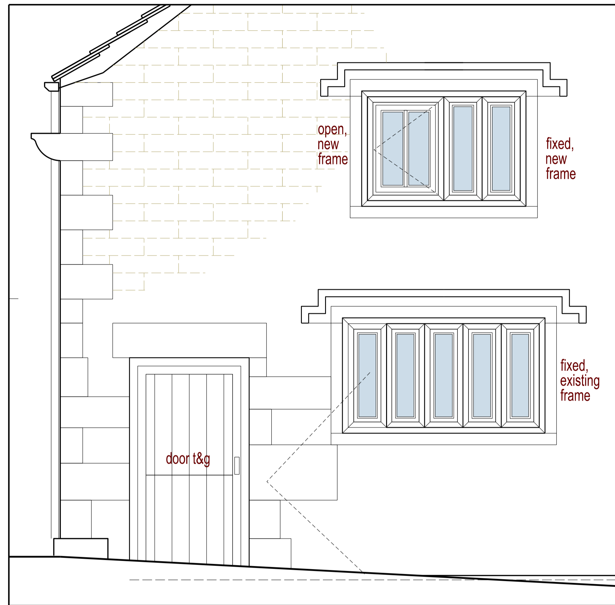
South Elevation, 1:20