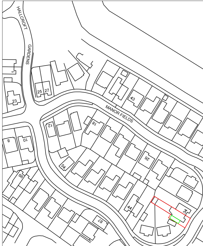
LOCATION PLAN SCALE 1:1250 AT A3