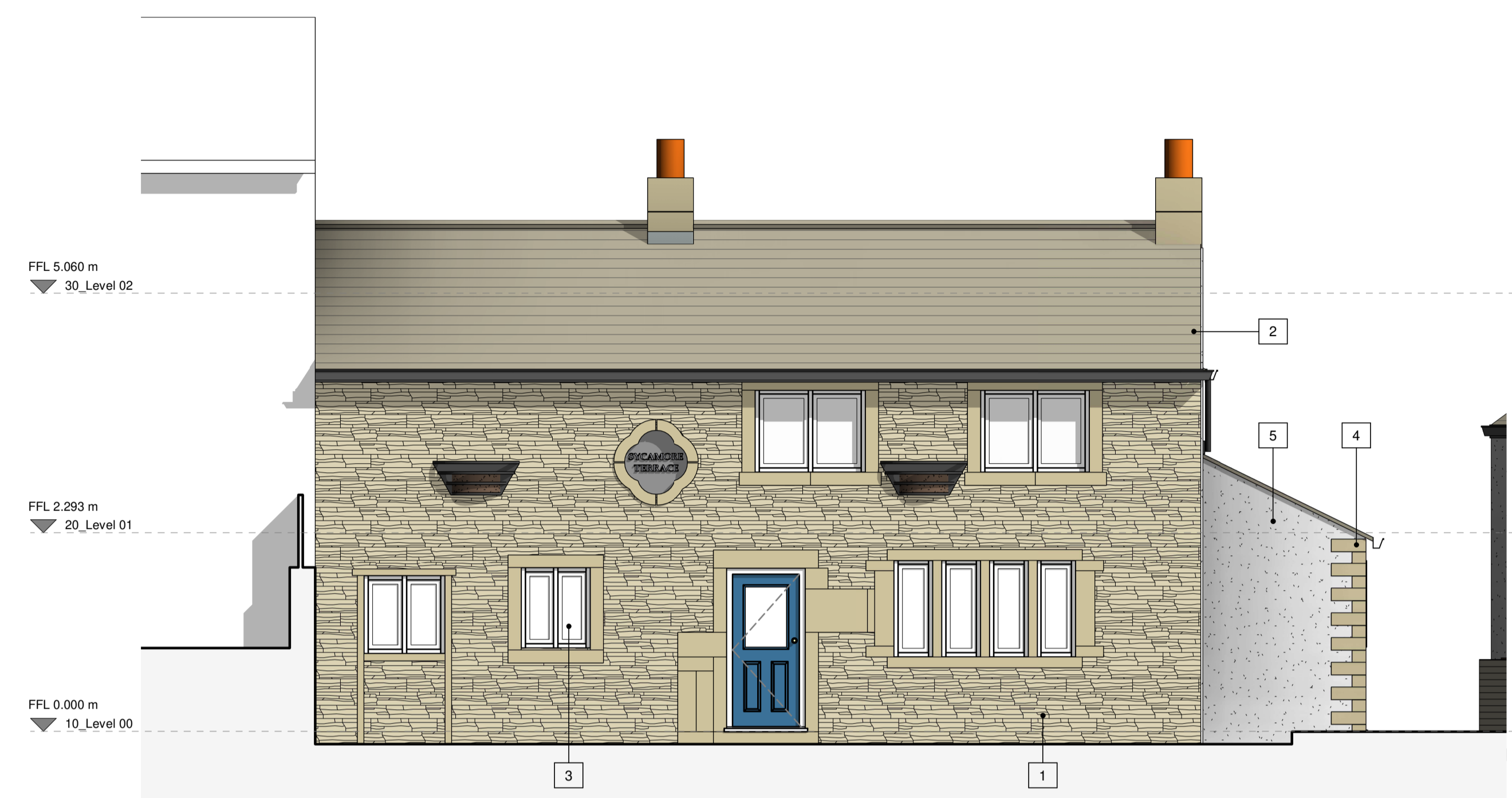
A - EXISTING FRONT ELEVATION 1 : 50