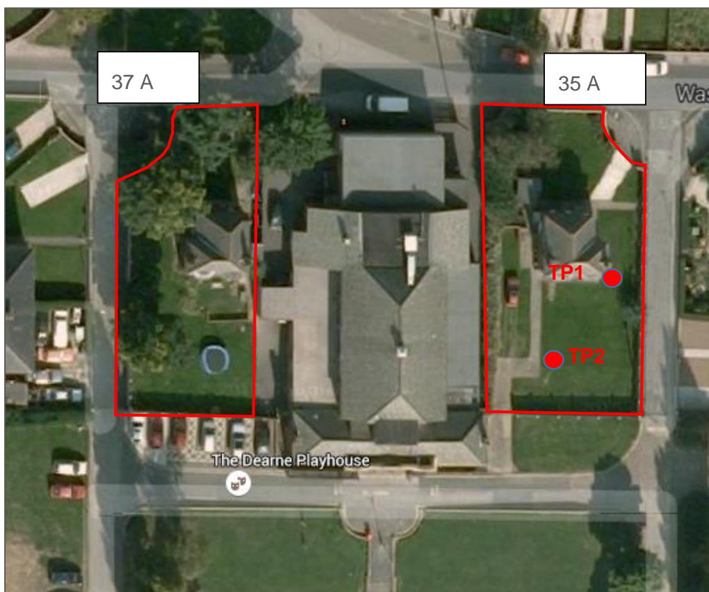
Figure 2 – Trial pit photographs

Trial pits were dug to a depth of 1m with a 0.3m x 0.3m hole dug in the base (for locations see Figure 2). The trial pit locations are considered to represent similar ground conditions within plot 37A. The test was performed on 15.09.2015. The day was wet and the days preceding the test included heavy downpours.