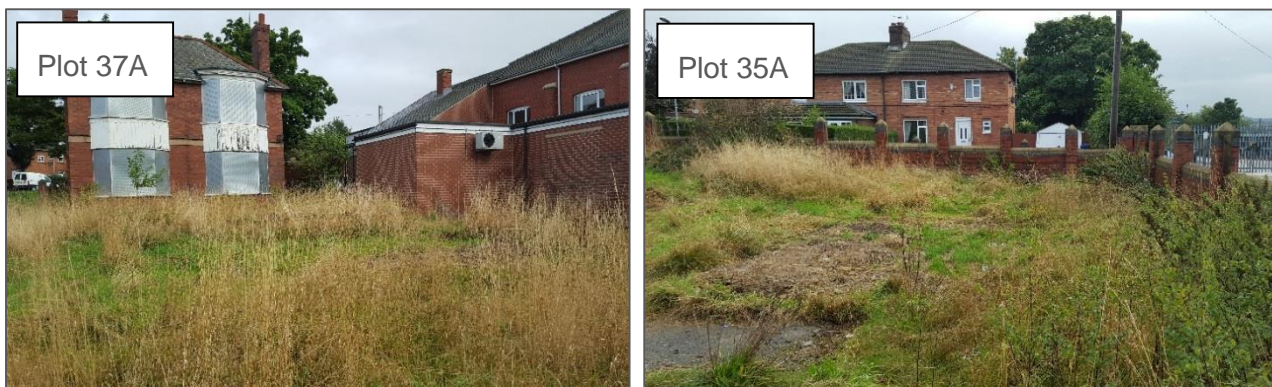
Figure 1 – Existing site photographs

Plots 35A and 37A are located to the south of Washington Road which is located east of Goldthorpe Road. Between the sites is the Dearne Playhouse building. Both sites currently consist of a residential dwelling, impermeable walkways and permeable garden areas. Plot 35A has an impermeable area of approximately 192m 2 and plot 37A has an impermeable area of 133m 2 . Roof water on both plots appears to be collected by downpipes and guttering and discharged into an on-site drainage system and conveyed into a Yorkshire Water sewer. Water falling on the impermeable surfaces has no formal drainage and runs off the areas before infiltrating into the permeable areas on site. Photographs of the site can be found in Figure 1 below.