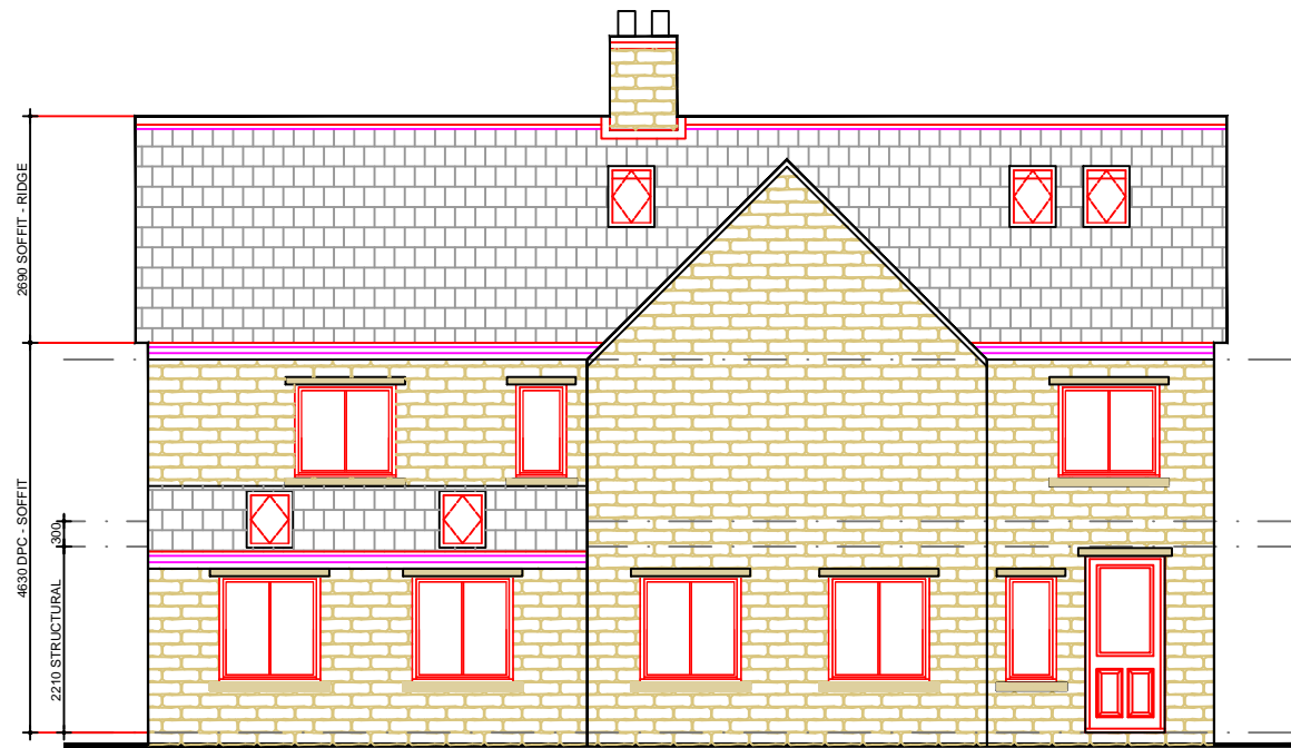
PROPOSED- REAR ELEVATION