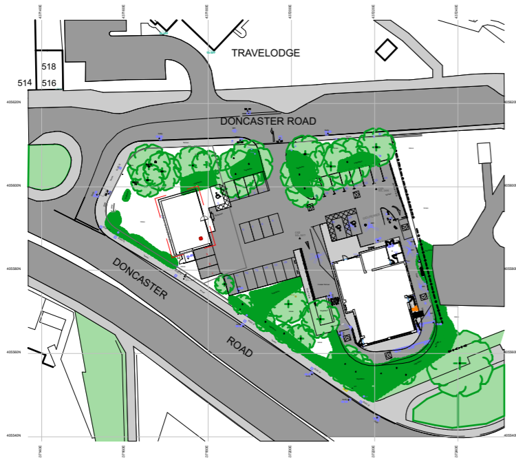
1:1250 Site Plan