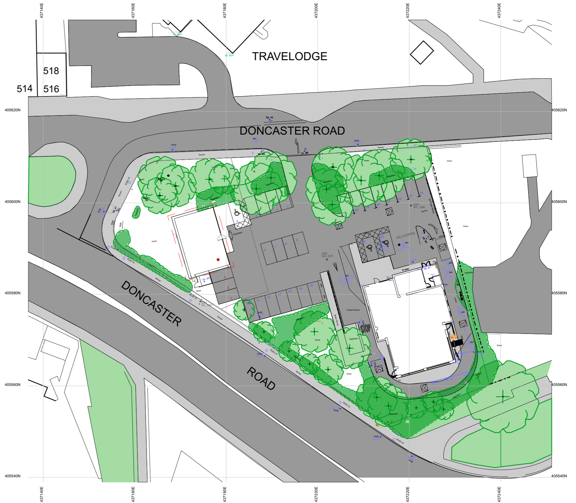
1:500 Location Plan